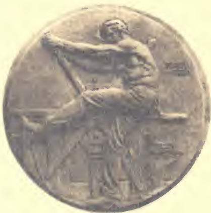
MEDAL OF THE AMERICAN INSTITUTE OF GRAPHIC ARTS