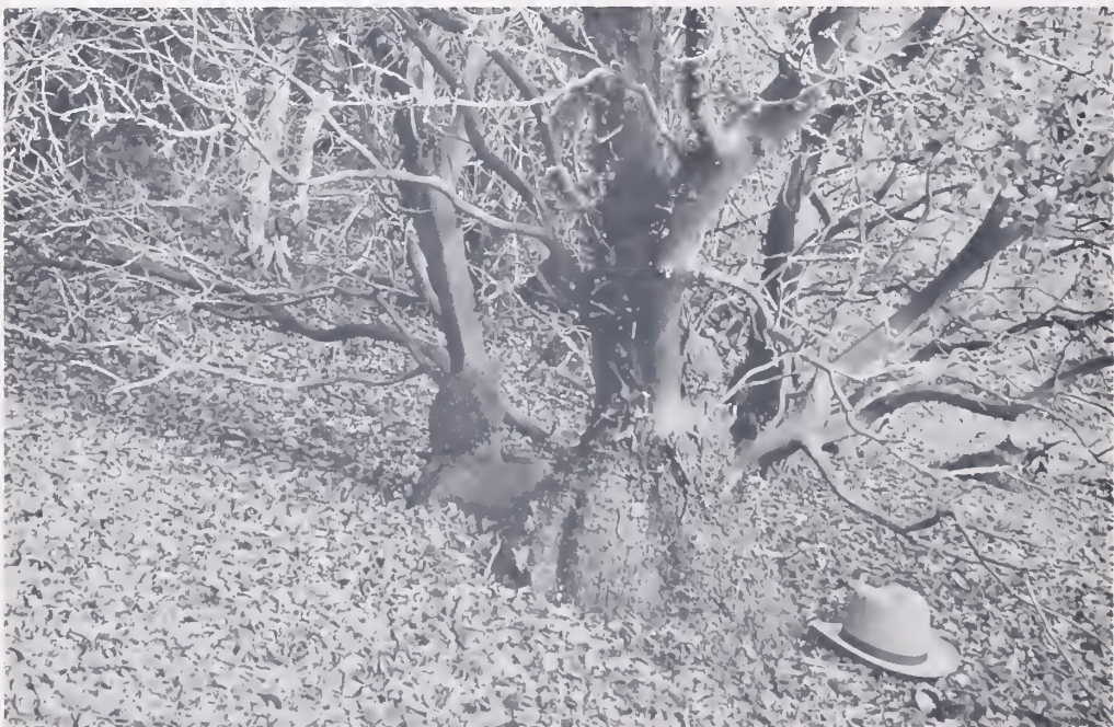
Figure 2b.--Burl formation at the base of Eastwood manzanita shrub in Santa Cruz County. This is larger than normal but fairly typical of quality found in some areas.