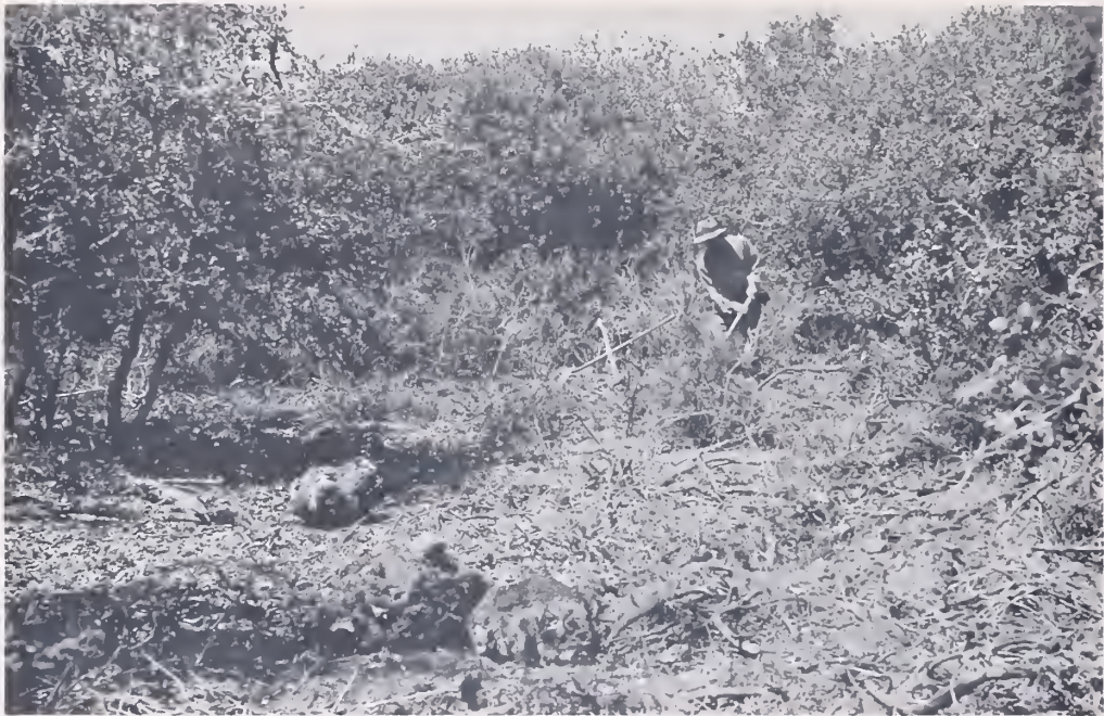
Figure 2a.--Opening in brush field in Monterey County where burls have been extracted. Worker is chopping off excess branches and roots. Note burls in foreground ready to be hauled to pipe-block mill.