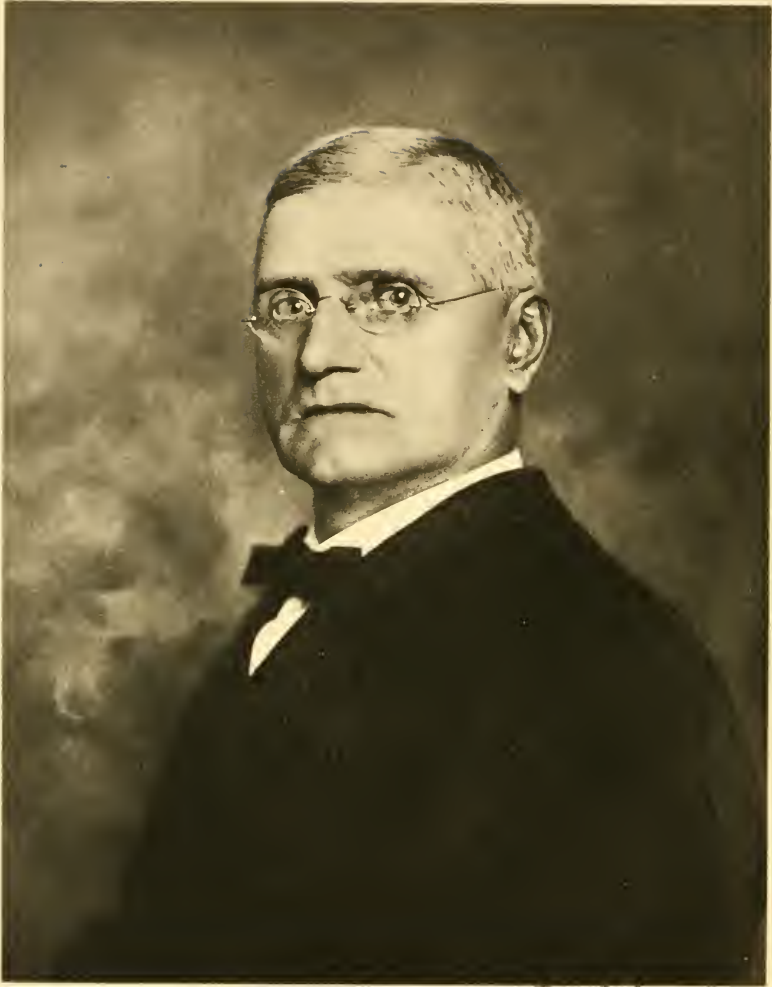
Thomson-Elis Company, Baltimore