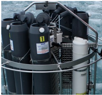
Ocean Acidification in Glacier Bay > ARTICLE