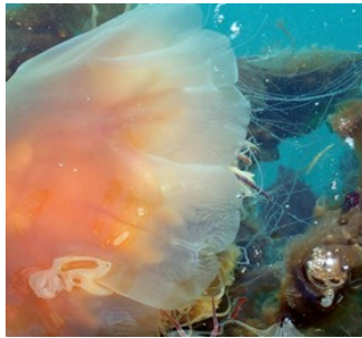
The Glacier Bay Marine Environment > ARTICLE