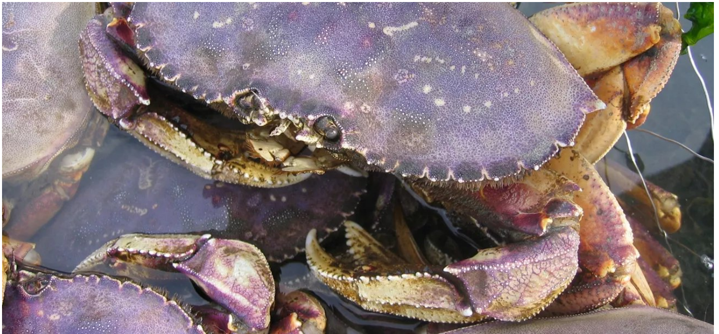
Dungeness crabs can be purple to grayish-brown, with cream colored undersides.