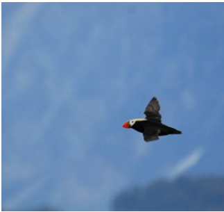
Seabirds in Glacier Bay > ARTICLE