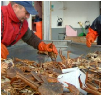
Glacier Bay Tanner Crab Survey > ARTICLE