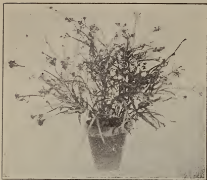
Pteris serrulata crist-variegata