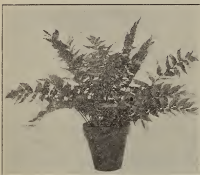
Aspidium Cyrtomium falcatum