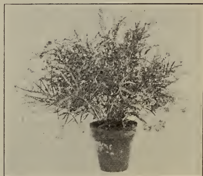
Pteris cretica Wimsettii