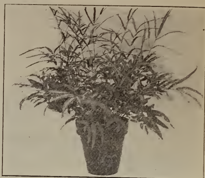
Pteris cretica albo-lineata