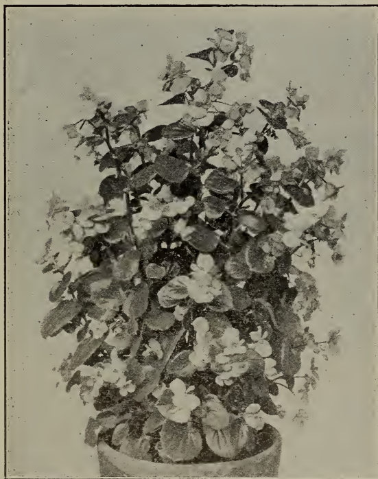
Begonia Glorie de Chateline

2¼-inch pots: $17.50 per 100; $150.00 per 1000.