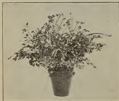
Pteris cretica Wilsonii