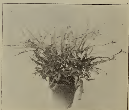
Pteris cretica Mayii