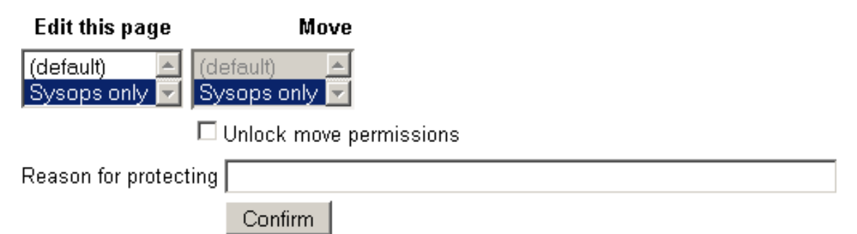
Figure 2 The protection screen in MediaWiki 1.5 and later

By default the left and right options both move to the same place when you change the left-hand one. If you check "Unlock move permissions" each may be adjusted independently. You can for example decide to allow only sysops to edit the page, but for non-sysops--the "(default)" category--to move the page if they choose to do so. In most cases you will want to protect against both, which is why this is the default. Some wikis also have a "new users" option (not shown).