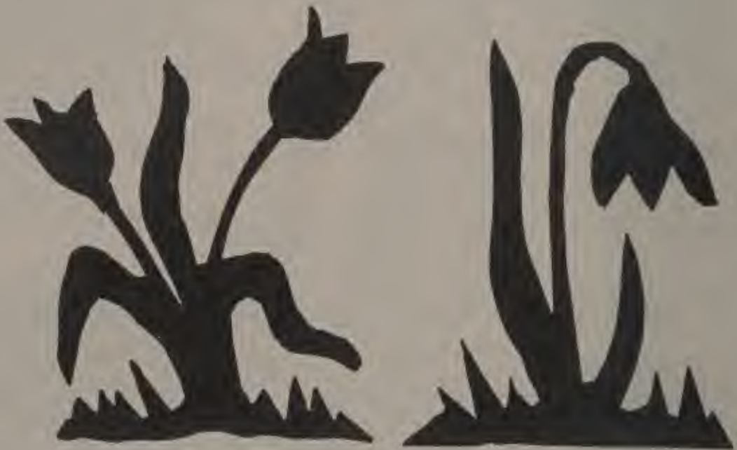
Something to Cut and Paste