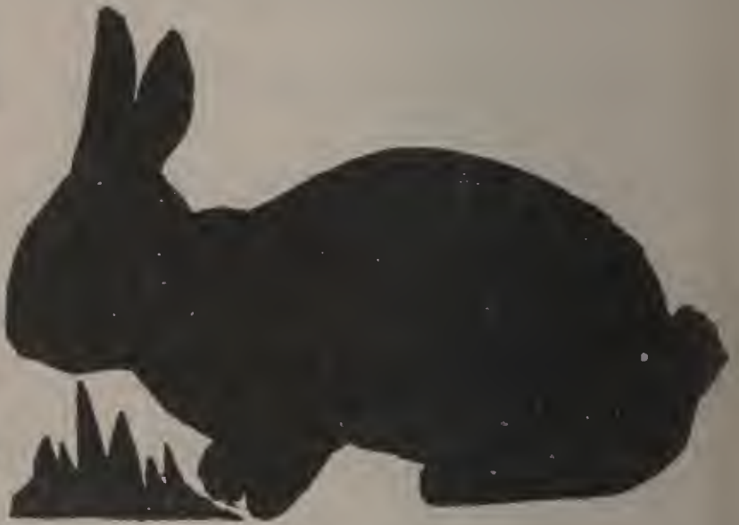
Something to Cut and Paste