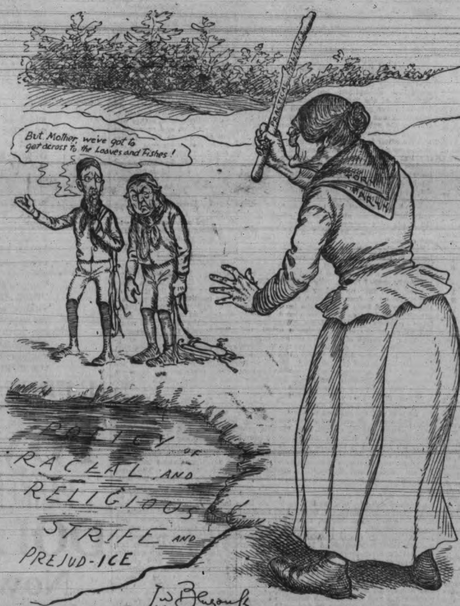
SOUND ADVICE AND UNSOUND ICE. THE OLD LADY—Now, then, you boys! don't you dare to go on that ice; it won't support you, and you'll lose your political lives for sure if you venture!

in the Fraser. Care will probably prevent any disaster. The journey will be made to Cariboo next year much more comfortably and in one day less. Two days to Queenslie, three to Barkerville.