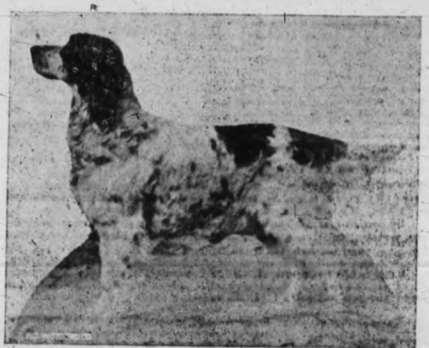
TO BE EXHIBITED HERE.

English setter, "Rodfield" a handsome son of the greatest living English setter sire, Champion Rodfield, and the pure Llewellyn and Laverack bred bitch "Daisy Bondhu 2nd."