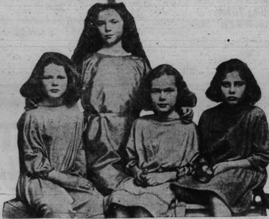
ADOPTED BY MRS. EMMELINE PANKHURST.—The four charming little English girls, orphaned during the war whom Mrs. Pankhurst brought with her to Canada.