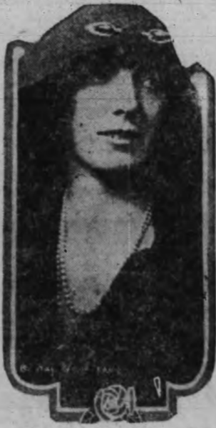
BRAVES SAVAGES.—Mrs. Rosita Forbes, world-famous woman explorer, who is lecturing on her adventures among the tribes of the Sahara, in Canada and United States.