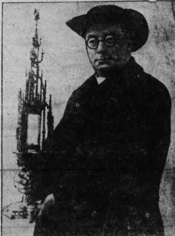
POPE'S PRELATE COMES.—Above is shown the Right Rev. Monsignor Newsome, of England, who is domestic prelate to the Pope.