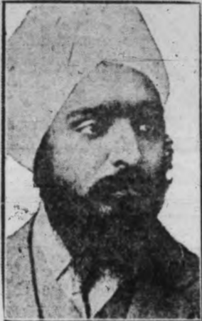
AT PEAK OF CRISIS.—Maharaja of Nabha, Sikh agitator whose deposition by the British has been one of the chief factors in the present crisis in the Punjab.