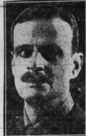
BACK WITHOUT FIGHT.—John Jacob Astor, who, after having forfeited his seat in the British Commons through inadvertent voting before he had taken the oath of office, was re-elected unopposed.