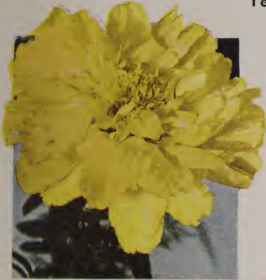
Marigold, Yellow Supreme

A glorious new Marigold of the lovely Carnation-Flowered type with extra-large blooms of an intense rich pure yellow color. The flowers measure nearly 3 inches in diameter and instead of the strong Marigold odor, they have a distinct and sweet fragrance. Be sure to grow it. 1935 Gold Medal Winner. Pkt., 15c; 1/4 oz., 50c.