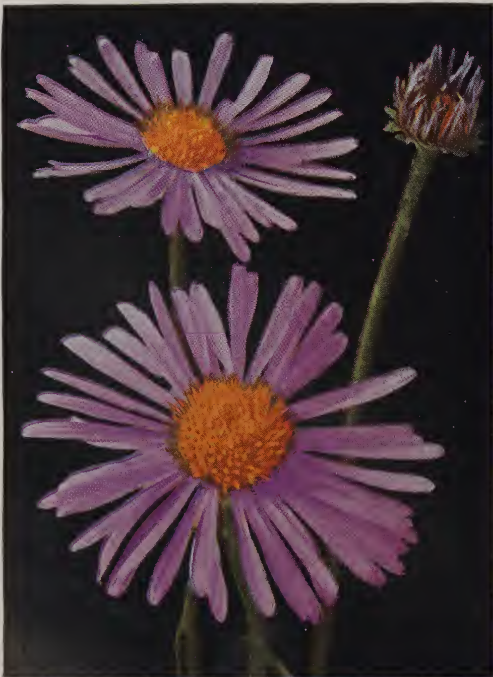
HARDY ASTER, SKYLANDS QUEEN

RHEINGOLD. Large star-shaped flowers of pure golden yellow. Height, 24 inches. Extra fine. Culture same as for Gladiolus.