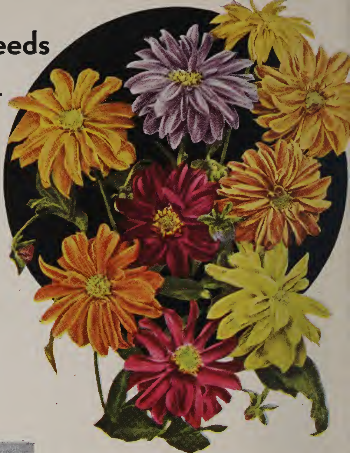
Unwin's Dwarf Dahlias

SINGLE. Mixed Colors. Pkt., 10c; 1/4 oz., 25c.