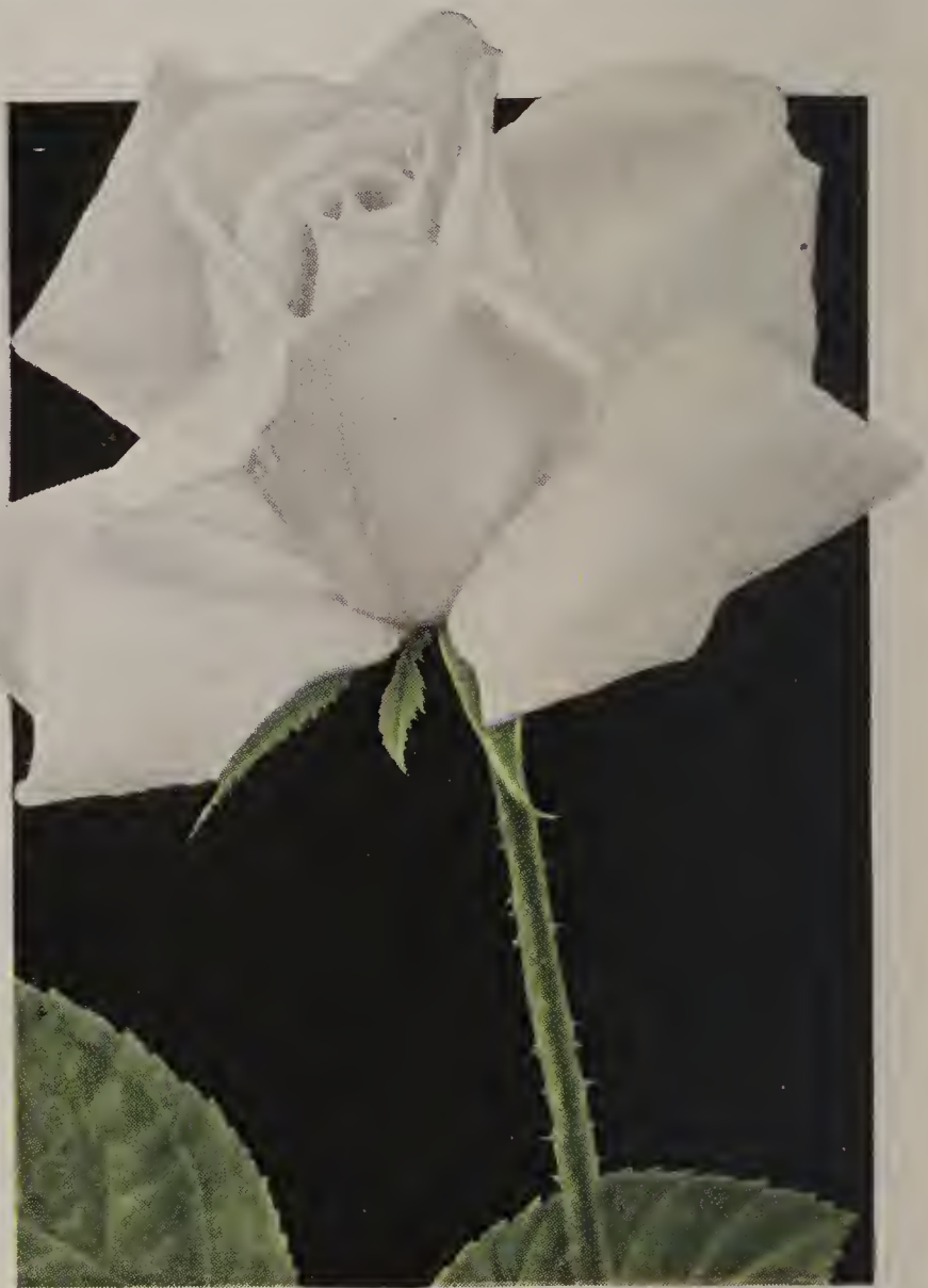
Mme. Jules Bouche