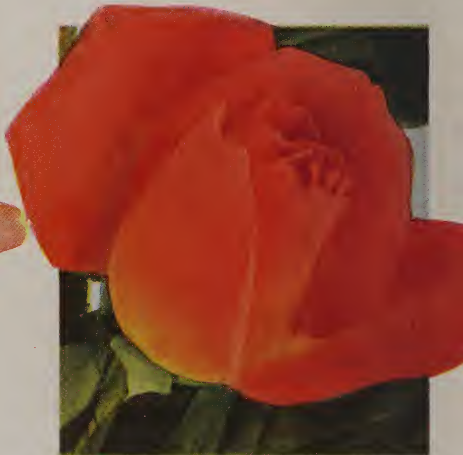
COPYRIGHT 1936 BY JACKSON & PERKINS CO.

Gloaming (Plant Patent No. 137). Flowers of soft, satiny pink, with underlying shades of orange. Fragrant. A vigorous grower. $1.50 each; 3 for $4.00; $15.00 per doz.