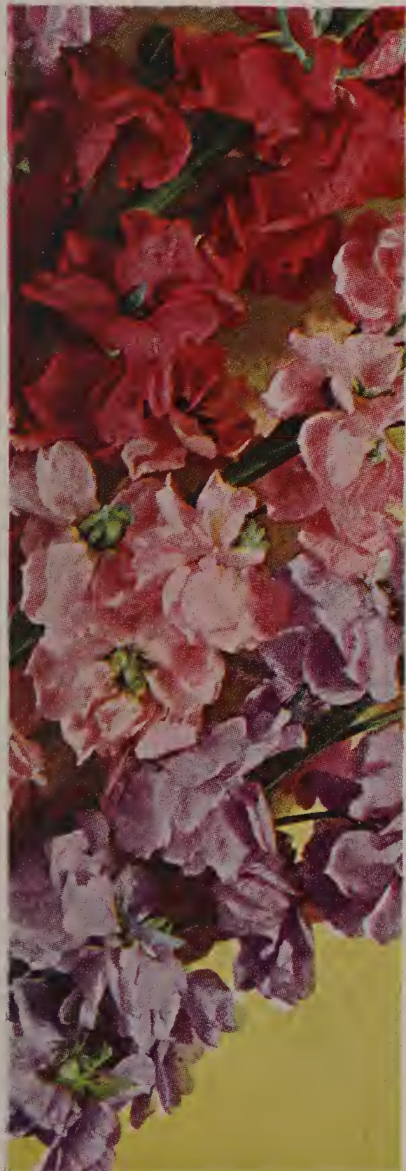
Double Giant Imperial Stock

FINEST MIXED. Award of Merit, 1936, All-America Selections. The flowers are mammoth in size, 4 to 5 inches in diameter. The mixture contains white and shades of pink. Pkt., 20c; 1/8 oz., 60c.