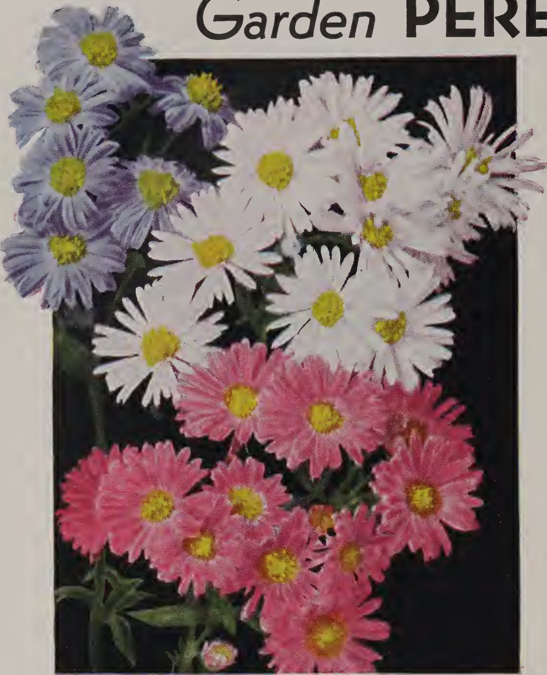
HARDY DWARF ASTERS