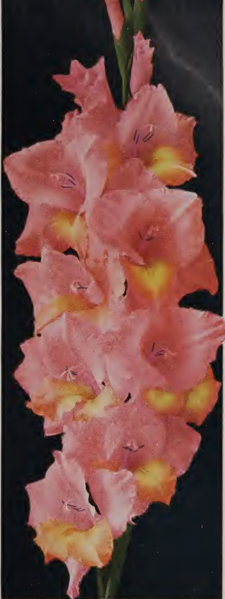
PICARDY. 80c per doz.; $6.00 per 100

We offer a special large flowering mixture at 50c per dozen, $3.50 per hundred. This mixture contains a complete color range and is excellent for cut flowers.