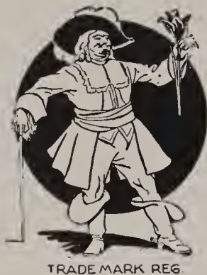
TRADE MARK REG.

We invite you and your friends to purchase any item herein listed with the same confidence that has inspired a steadily increasing business over a period of the past twenty-six years.