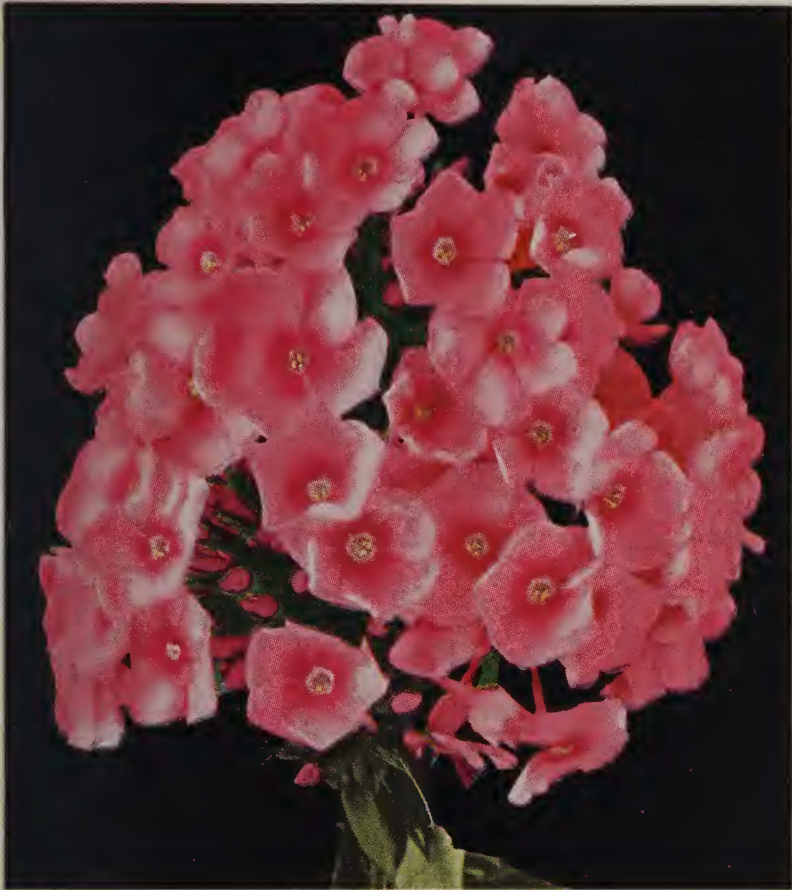
Phlox, Daily Sketch

Large Field-Grown Plants, Each, 40c; 3 for $1.10; 12 for $4.00.