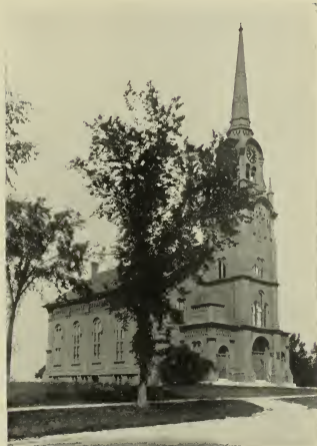
THE OLD SOUTH