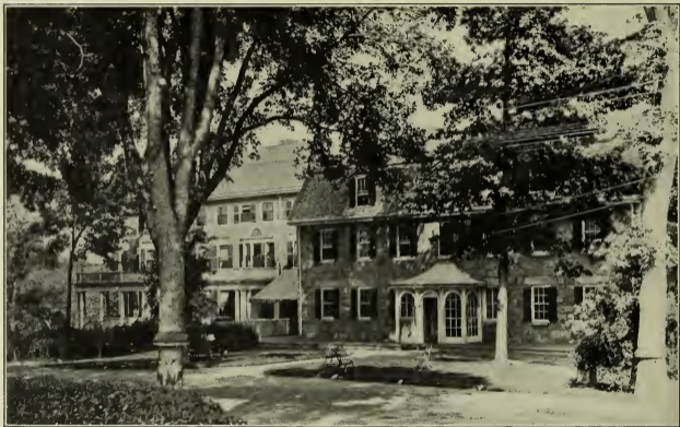
PHILLIPS INN — MRS. HARRIET BEECHER STOWE'S HOUSE