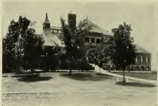
THE SCIENCE BUILDING