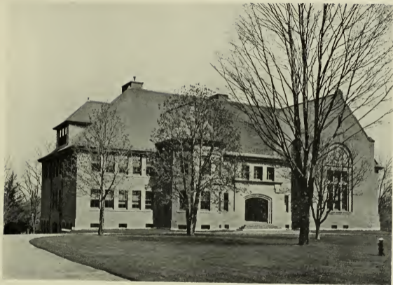
MCKREN MEMORIAL HALL