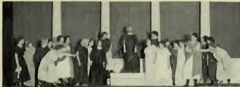
THE COMEDY OF ERRORS

Concerts by the best performers are given each year in Andover, and the Symphony rehearsals, the opera, as well as good plays, can be attended in Boston.