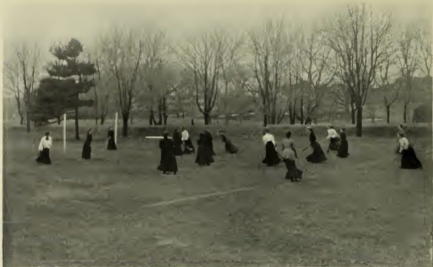
THE HOCKEY FIELD