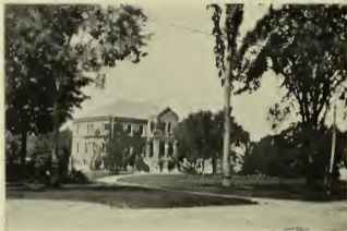
THE ACADEMY BUILDING