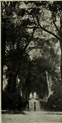
THE ELM ARCH

FIFTY-ONE years older than the sister Academy, Phillips Academy for boys has ever been a pleasant and profitable neighbor, and with the Theological Seminary, twenty-two years older, has cordially shared good things with Abbot Academy. Lectures by world-famous men, many of whom like to come to talk especially to the girls; talks from professors and teachers, great interscholastic football, base-ball and basket-ball games; concerts, promenades and plays all vary the long school year most pleasantly, and occasional intercourse with brothers, cousins, mutual friends or friends from the same town, relieves the loneliness and sense of distance from home.