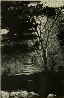
THE OLD RAILROAD

the big neighbor, Lawrence, with her thousands