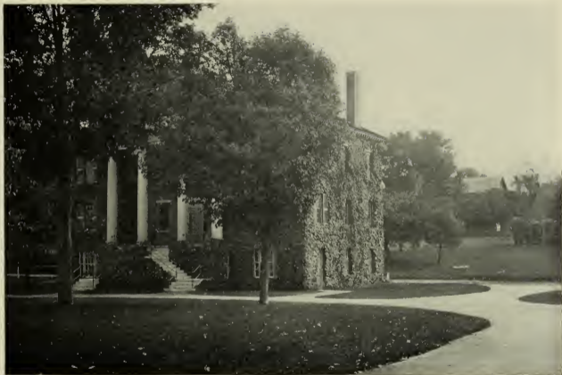
ABBOT HALL — 1904