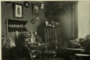
A STUDENT'S ROOM

WITHIN Draper Hall the pleasant drawing-room for the reception of friends opens with other public rooms into a large space for teas or for evening gatherings. The life of the girls in their rooms can only be understood by those who themselves have had such happy school days. Cor-