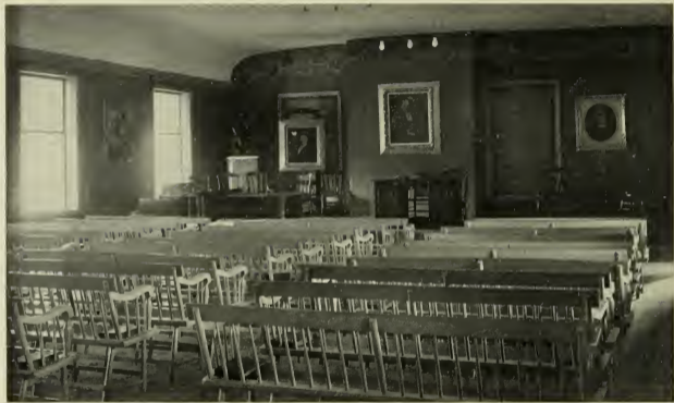
THE "HALL" IN ABBOT HALL