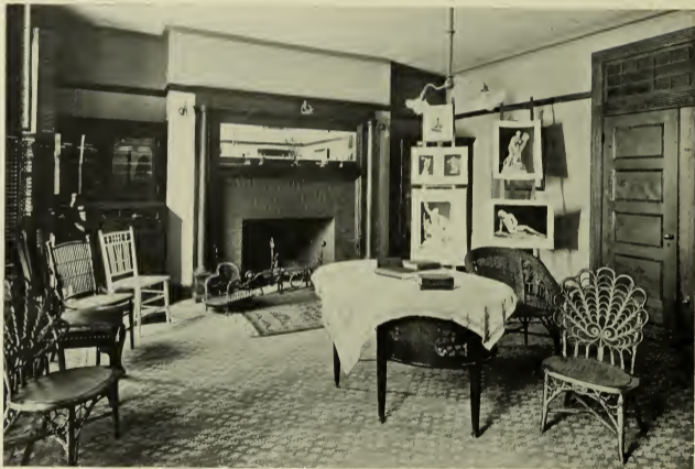
THE SENIORS' PARLOR