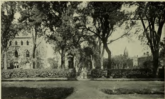
THE ELM ARCH AND THEOLOGICAL SEMINARY