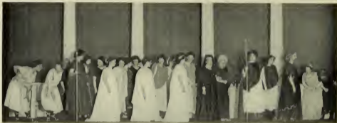
THE COMEDY OF ERRORS