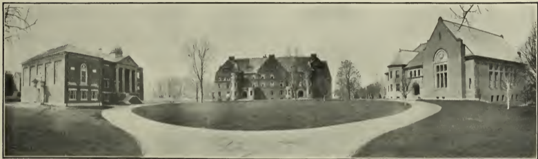
ABBOT ACADEMY ANDOVER, MASSACHUSETTS