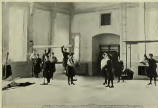
IN THE GYMNASIUM

winter the new gymnasium gives a chance for indoor work with the Swedish system, and for basket-ball; and coasting and skating come according to the weather conditions.