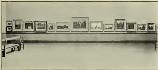
INTERIOR JOHN-ESTHER GALLERY