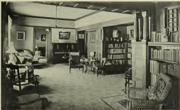
THE MCKEEN ROOMS