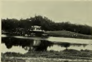
THE GOLF CLUB