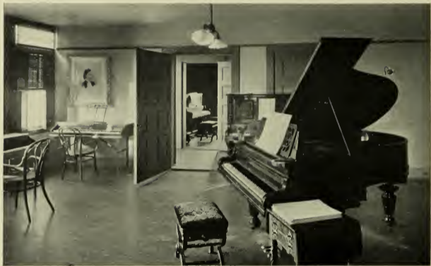
THE MUSIC ROOM