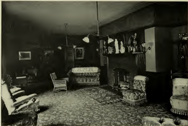
THE MASON DRAWING-ROOM