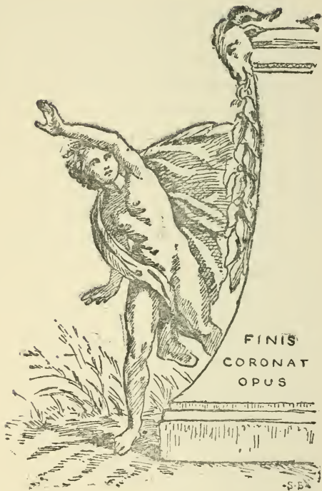
"Syrinx escaping Pan" (Adapted from Bartolozzi's Frontispiece) See List of Prints, No. 285