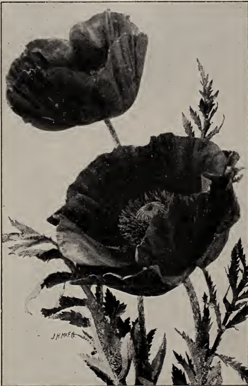
Oriental Poppies ( Papaver orientale )

PENTSTEMON torreyi. Torrey Pentstemon. Spikes of bright scarlet flowers. 4 to 5 ft. June to Aug. 25 cts. each, $2 for 10.