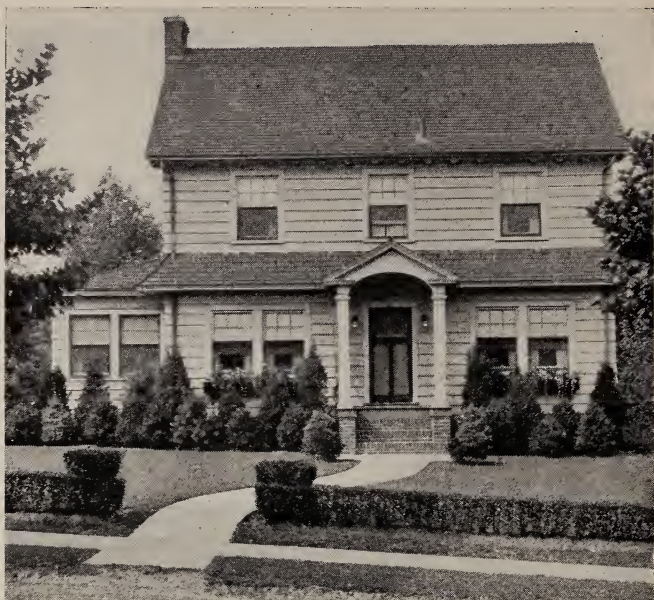
Evergreens in variety are indispensable for grouping around the house