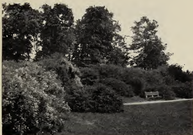
Shrubs and shade trees make a wonderfully fine lawn border