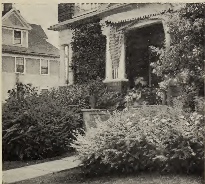
Foundation Planting of Shrubs