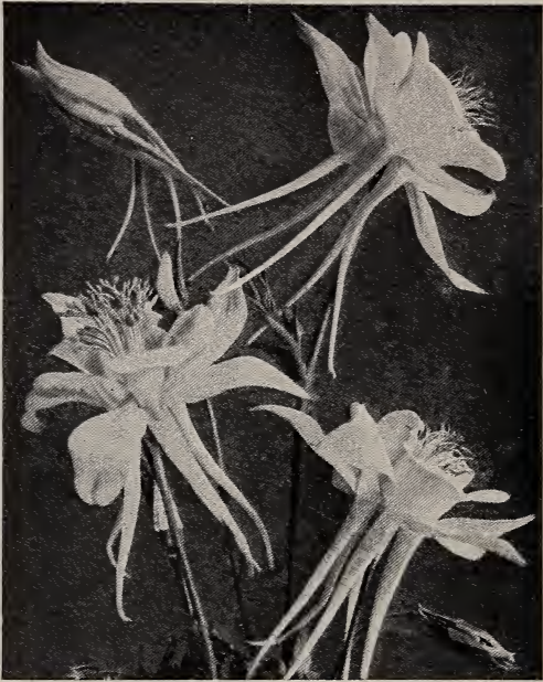
Long-spurred Hybrid Columbines