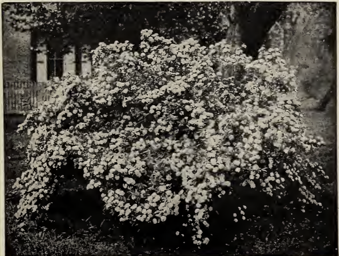
Spiraea Van Houttei