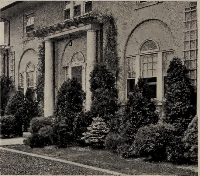
Evergreen Foundation Planting