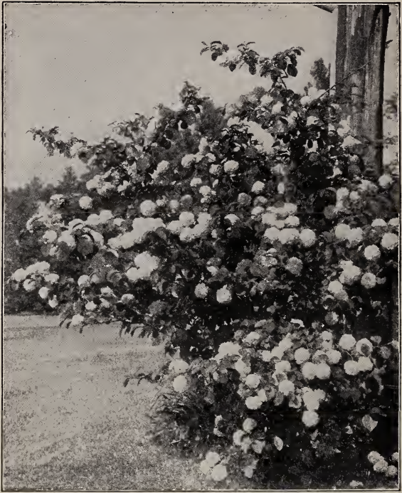
Viburnum tomentosum plicatum (Japanese Snowball)