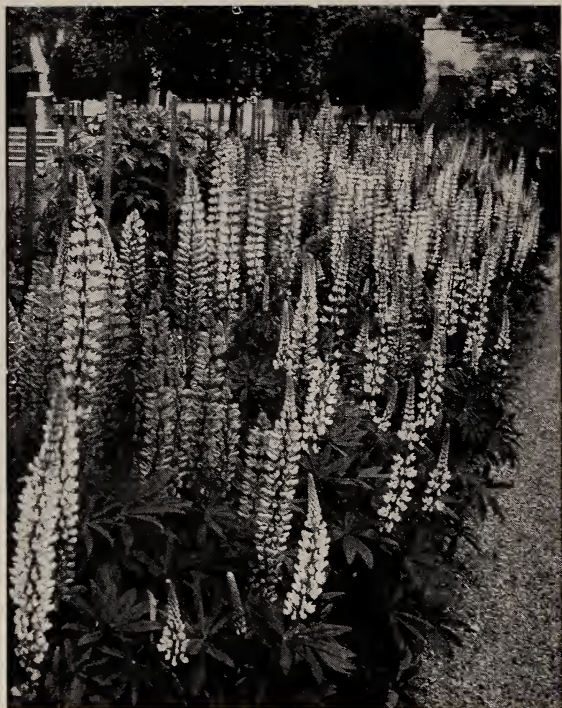
Lupines ( Lupinus )

KNIPHOFIA pfitzeriana. Bonfire Torch Lily. The ever-blooming flame flower; all season; best variety for massing. It is best to dig these plants up in the fall and store in a cool cellar. 35 cts. each, $3 for 10.