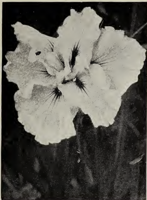
Japanese Iris ( Iris Kaempferi )