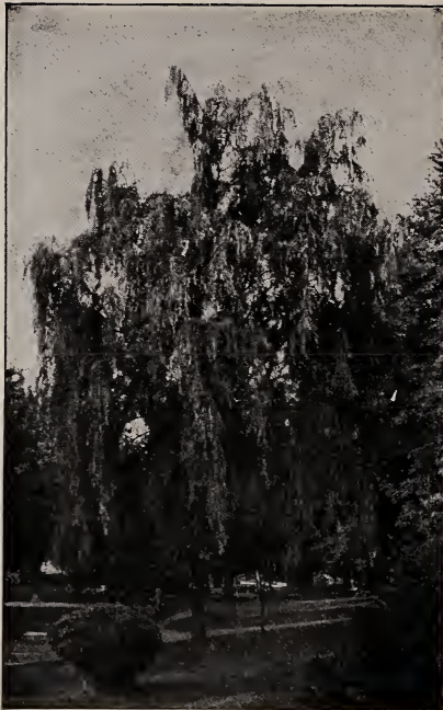
Weeping Willow. See page 17