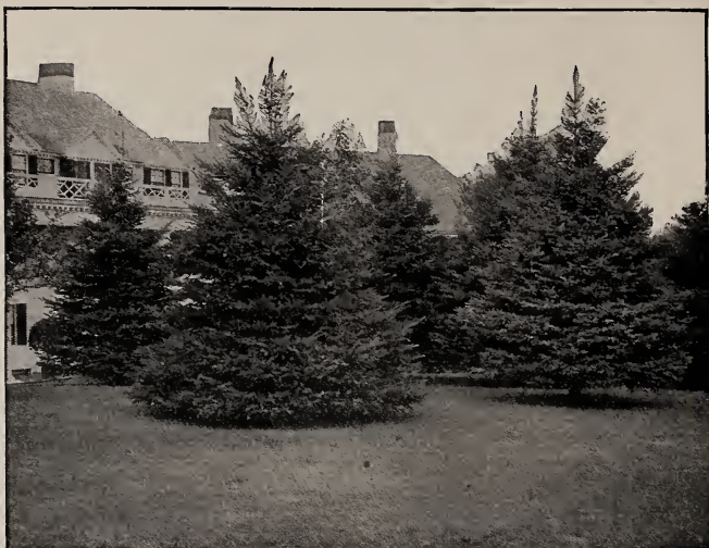
Norway Spruce ( Picea excelsa )