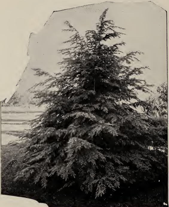
Canada Hemlock is useful for screens, hedges, or specimens