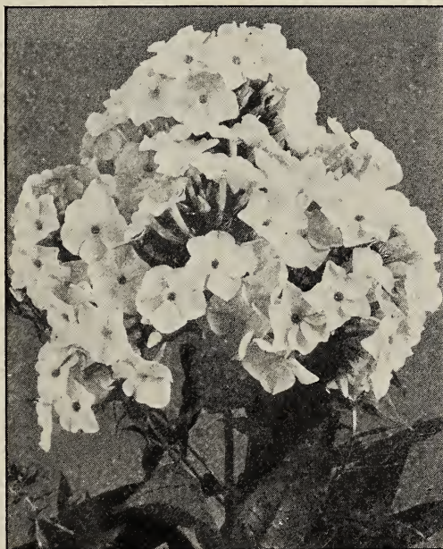
Phlox, Miss Lingard

Strong, field-grown plants of above, 30 cts. each, $2.50 for 10, $18 per 100, except where otherwise noted