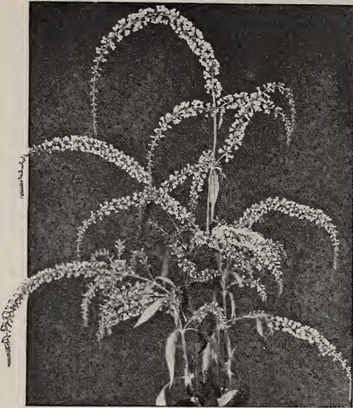
Buddleia. See page 21