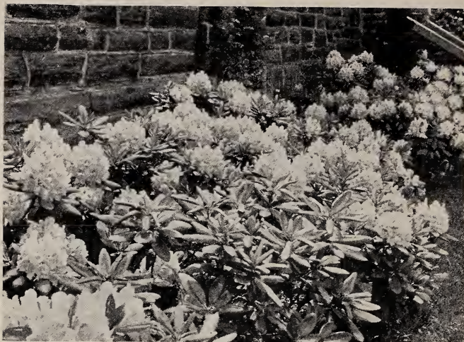
Foundation planting of Rhododendrons