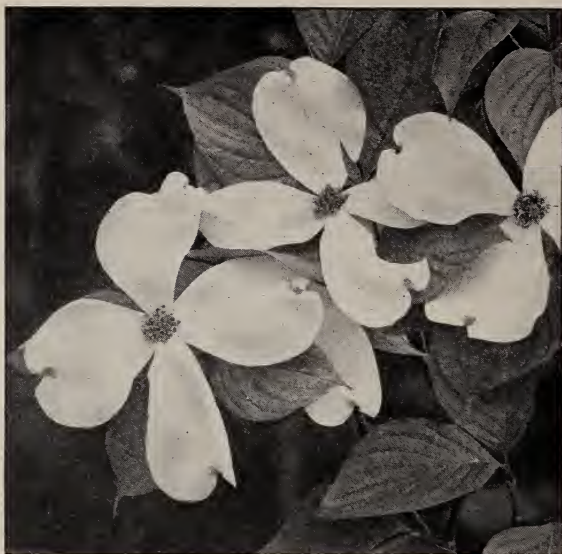
Flowers of the White-flowering Dogwood ( Cornus florida )