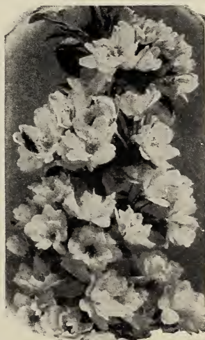
Malus floribunda (Flowering Crab)