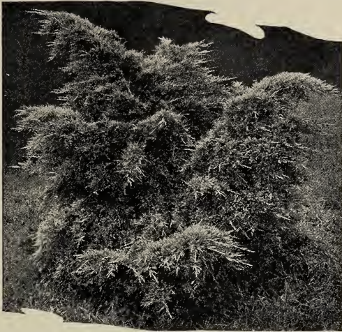
Juniperus pfitzeriana is a graceful evergreen for foundation or specimen planting