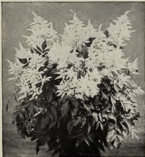
Spiraea (Astilbe) japonica

Strong, field-grown plants of above, 30 cts. each, $2.50 for 10, $18 per 100, except where otherwise noted