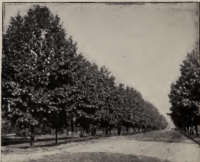
Oaks are among the best trees for street planting