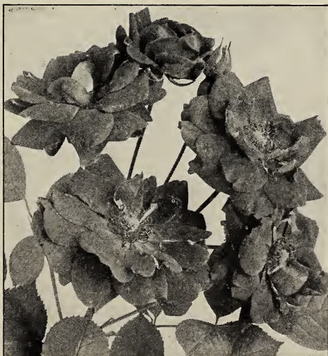
Paul's Scarlet Climber Roses. See page 52