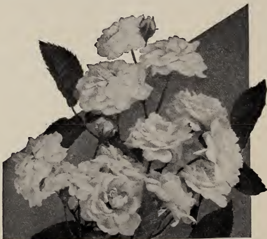
White Baby Rambler