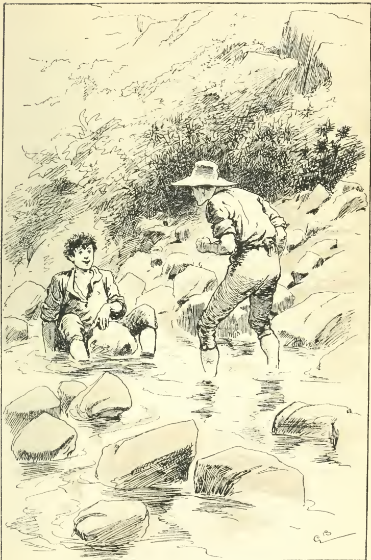
“HE WAS SO OVERCOME . . . . THAT HE SAT STRAIGHT DOWN INTO THE STREAM.” (p. 130.)