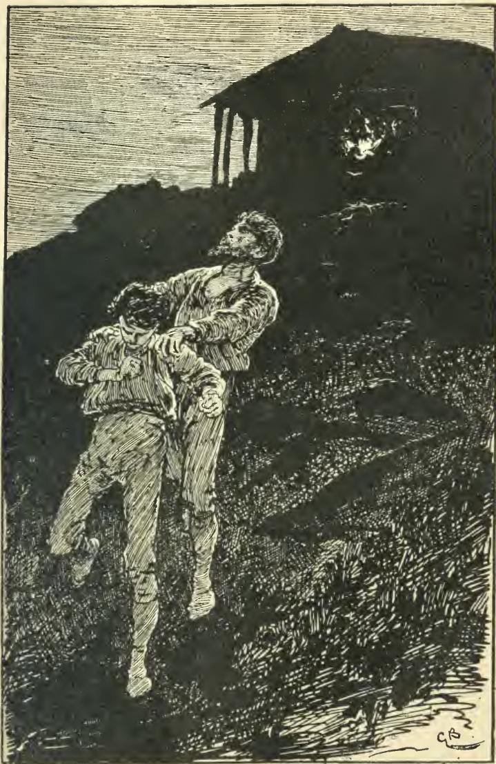
“TO SCREEN HIM FROM STARLIGHT’S FIRE HE HAD INTERPOSED HIS OWN BODY.” (p. 256.)