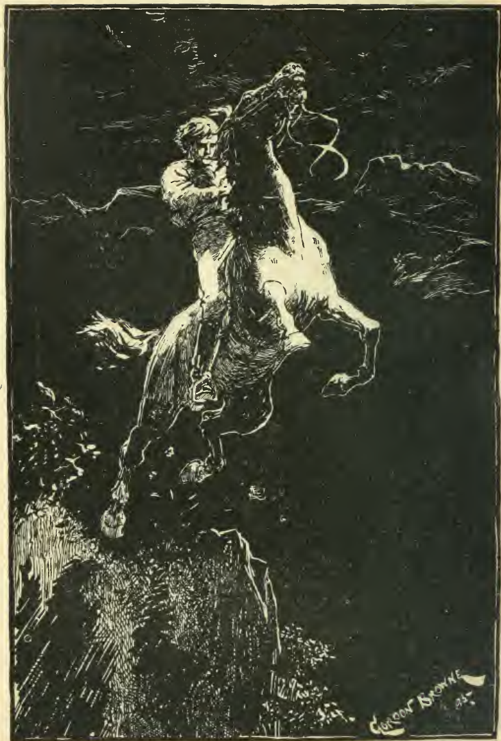
"THE BEAUTIFUL CREATURE ROSE TO THE LEAP." (f. 264.) Frontispiece.