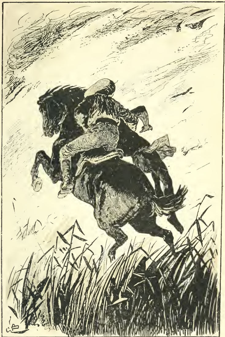
"HE SEIZED THE NATIVE ROUND HIS SLIM, NAKED BODY." (p. 79.)