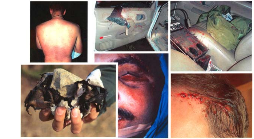
Injuries suffered by Border Patrol agents from rocks thrown