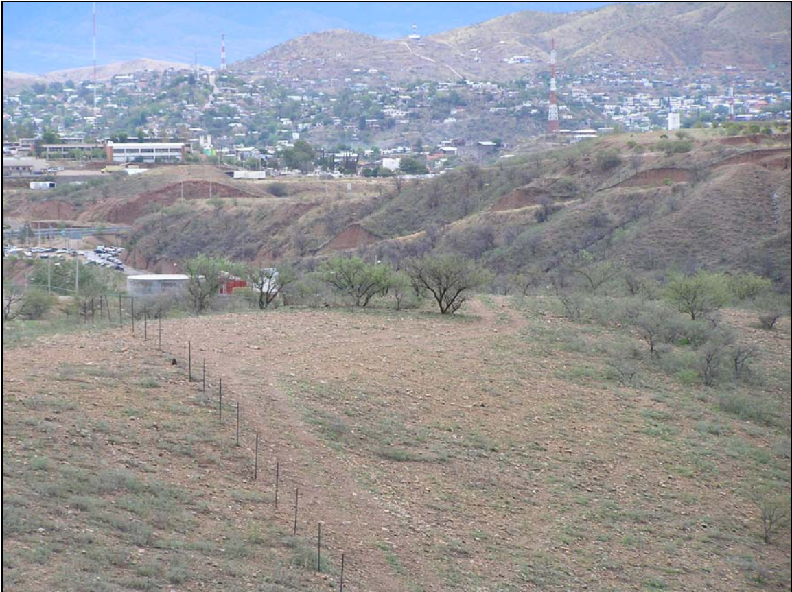
U.S.-Mexico border in Arizona

In addition to Federal agents, State and local law enforcement also patrol the border areas. In remote areas along the border, many sheriffs' departments are called upon to address border-related criminal matters and serve as a backstop to CBP operations. In many cases, these local law enforcement agencies do not have the resources necessary to patrol the thousands of square miles of border territory under their respective jurisdiction, leaving the security of the border vulnerable.