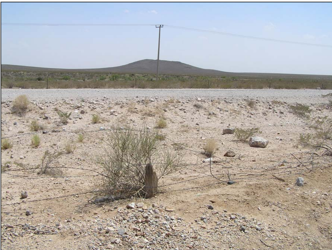
U.S.-Mexico border in New Mexico

The United States border with Mexico extends nearly 2,000 miles along the southern borders of California, Arizona, New Mexico and Texas. In most areas, the border is located in remote and sparsely populated areas of vast desert and rugged mountain terrain.