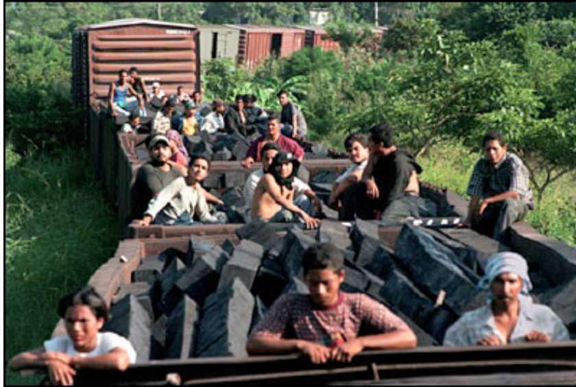
Trains from Central America and Mexico en route to the U.S. border