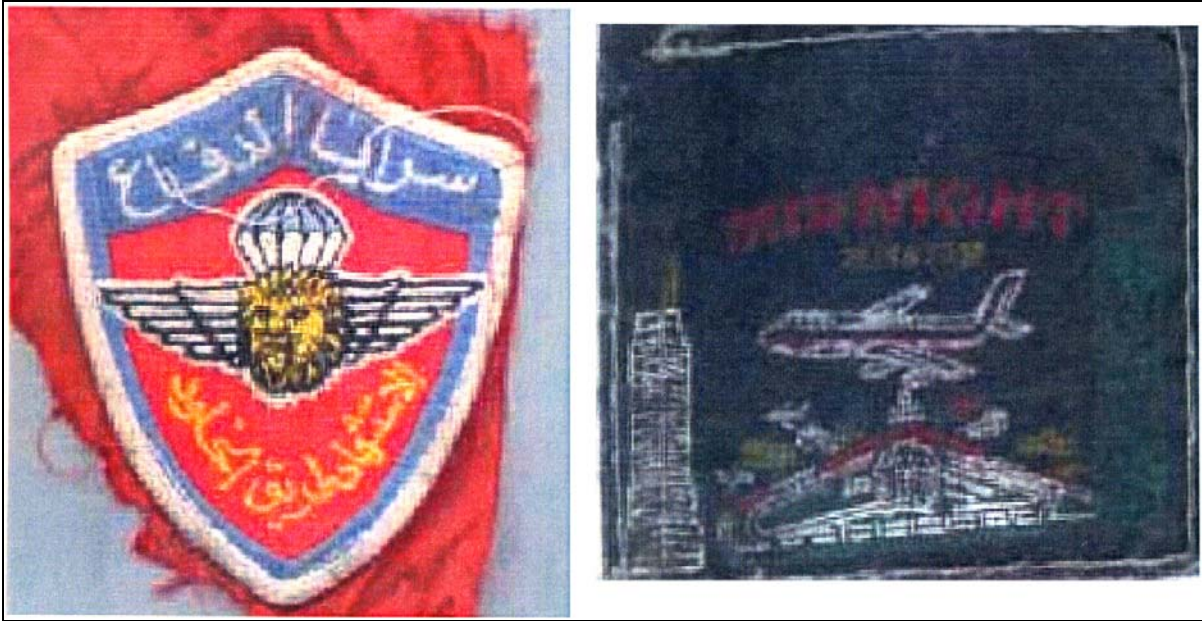
Military patches found along the Texas border.