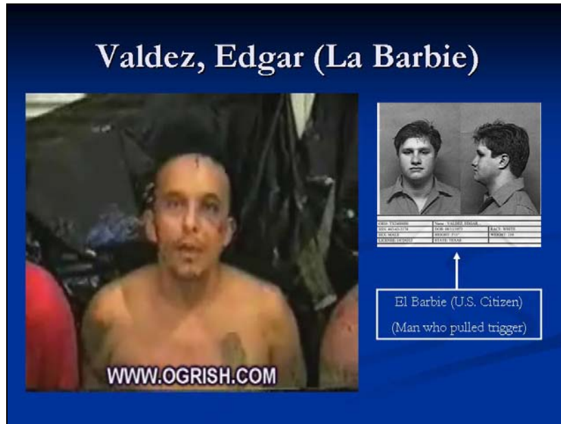
“La Barbie,” head of the Sinaloa enforcers alleged to have killed members of Zetas

camera captor. Law enforcement authorities have never found the body of the murdered Zeta, nor the other three men, dead or alive. 25