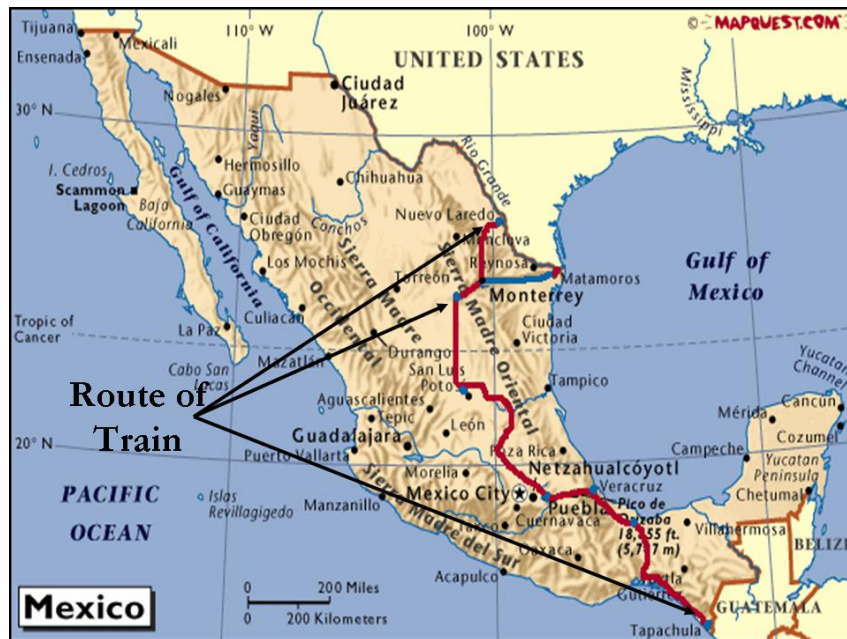
Train routes from Central America and Mexico with U.S. Destinations

The El Paso-Juarez corridor in west Texas also serves as the gateway for drugs destined to major metropolitan areas in the United States. Mexican drug cartels transport significant quantities of marijuana and cocaine through the El Paso Port of Entry using major east/west and north/south interstate highways. These highways provide the Mexican cartels with transportation routes for drug distribution throughout the United States. Drug cartels also obtain warehouses in El Paso for stash locations and recruit