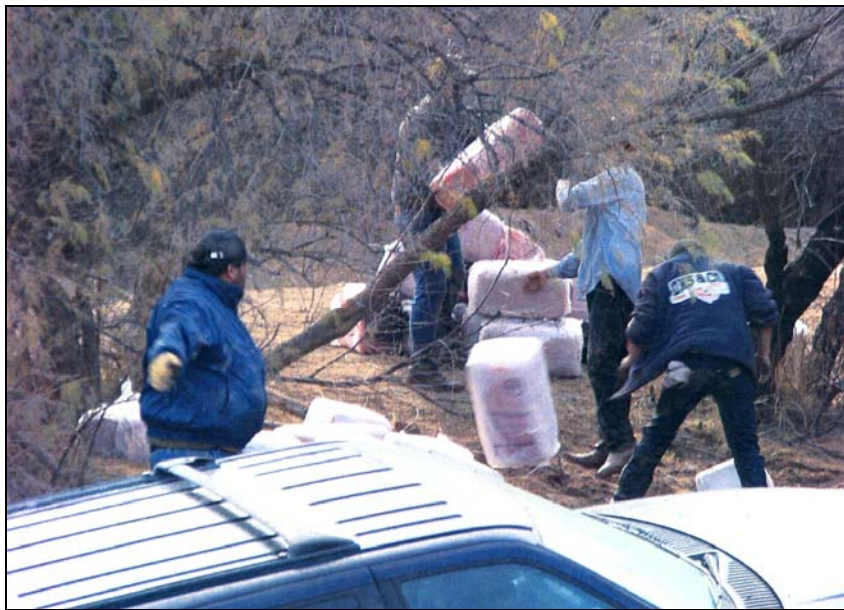
Cartel members unloading drugs after failed attempt at U.S. entry during alleged military incursion January 23, 2006

On January 25, 2006, the Ambassador sent a Diplomatic Note to the Mexican Government regarding the January 23, 2006 border incursion in Hudspeth County, Texas. Ambassador Garza requested the Mexican government fully investigate the January 23 incident in which individuals dressed in military uniforms, carrying military-style weapons, and using military vehicles intervened to prevent a drug shipment from being intercepted by U.S. law enforcement operating in the United States. 71