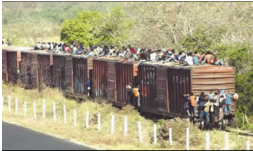
Trains from Central America and Mexico en route to the U.S. border

The South Texas region covers approximately 625 miles of border territory – a total area of 20,963 square miles and borders three separate Mexican States. Inside the territory are 11 Ports of Entry that include 15 international bridges. Directly across the cities of Brownsville, McAllen, and Laredo are major Mexican cities, each with a population between 600,000 and 800,000.