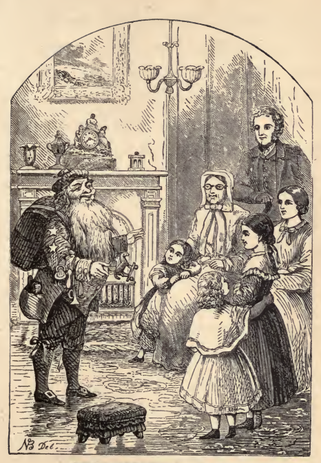
SUSY'S CHRISTMAS. Page 26.