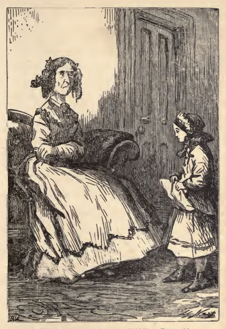
MRS. LOVEJOY AND SUSY. - Page 139.