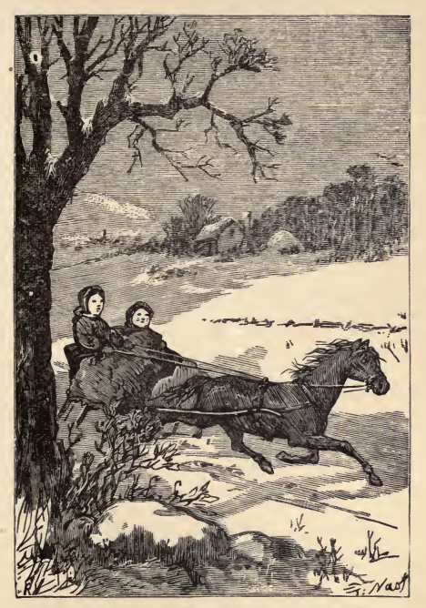
PRUDY AND SUSY SLEIGHING. - Page 72.