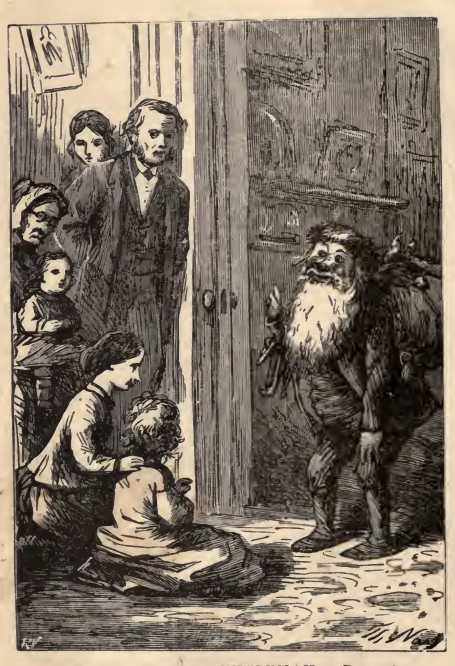
THE FUNNY OLD GENTLEMAN. - Page 26.