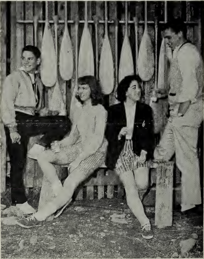
N-29337--(Similar picture: N-29339)