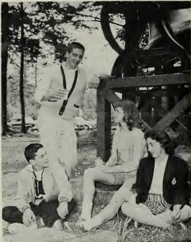
N-29340--(Similar picture: N-29336)