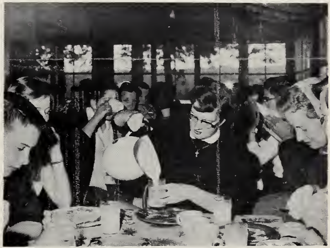
N-29333--(Similar picture: N-29329)