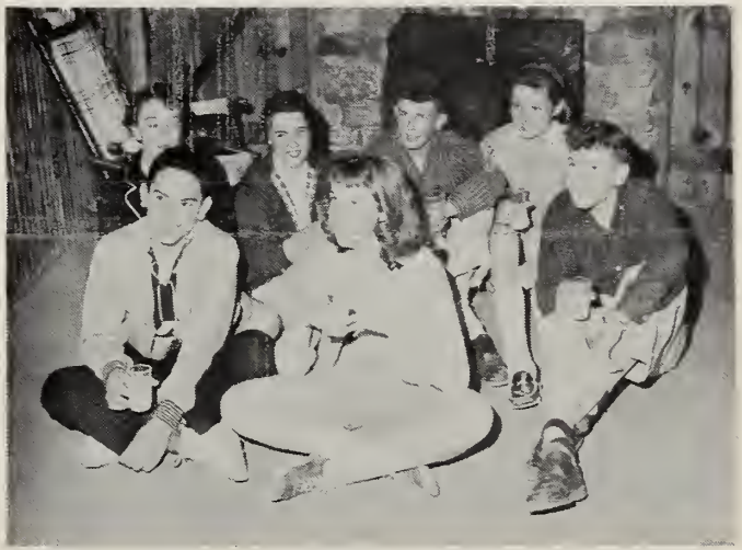
N-29334--(Similar picture: N-29338)

Magazines and newspapers may obtain glossy prints of any of these photographs from the Photography Division, Office of Information, U. S. Department of Agriculture, Washington 25, D. C. Others may purchase prints (8 x 10) at $1.00 each from the same address.