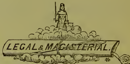
PRIVILEGE OF PEERAGE.