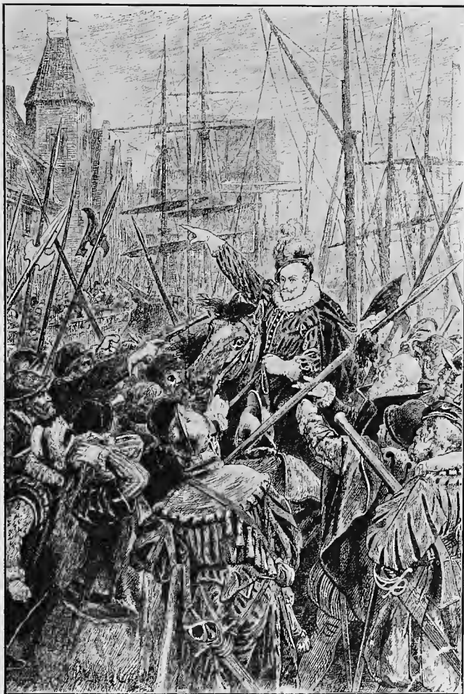
WILLIAM OF ORANGE QUELLS THE RIOT OF THE SECTARIANS WHILE TOULOUSE IS BEING ATTACKED BY LAUNOY