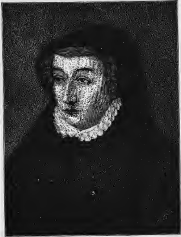
CATHERINE DE MEDICI Painting by François Clouet, Chantilly.