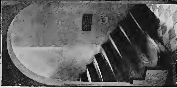
REFECTORY AND STAIRS IN THE HOUSE OF WILLIAM OF ORANGE AT DELFT.

Tablet commemorates place of assassination.