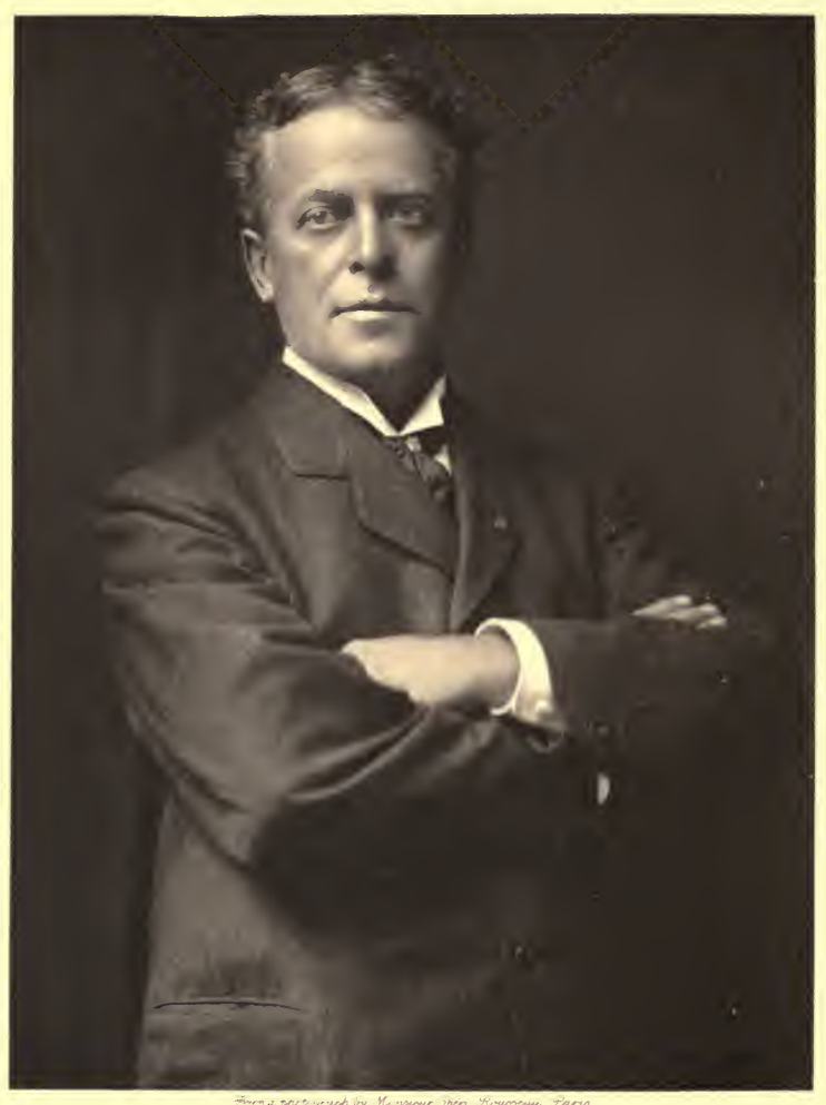
Forms once weigh by Minoiner min Krumeuu, Faru