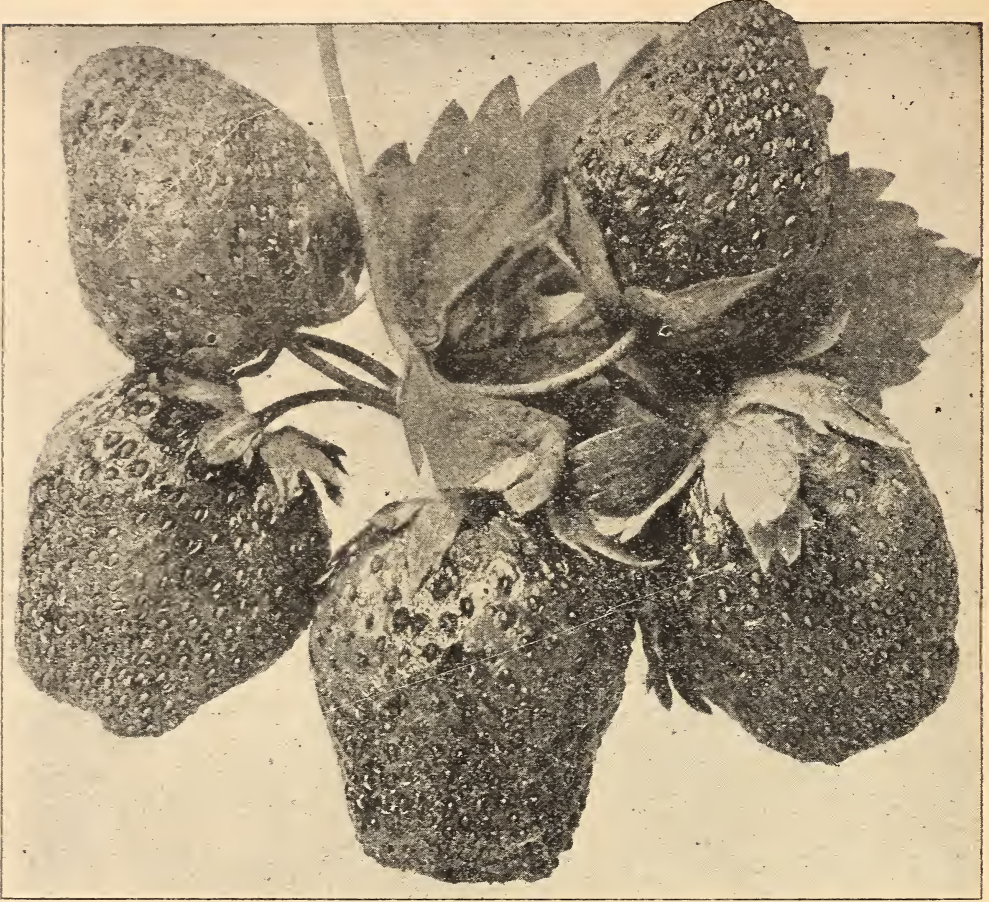
H A V E R L A N D

HEFLIN EARLY. (Per.) Very early, fruit small to medium. A very heavy cropper and a safe variety for all soils, and will stand very poor treatment.