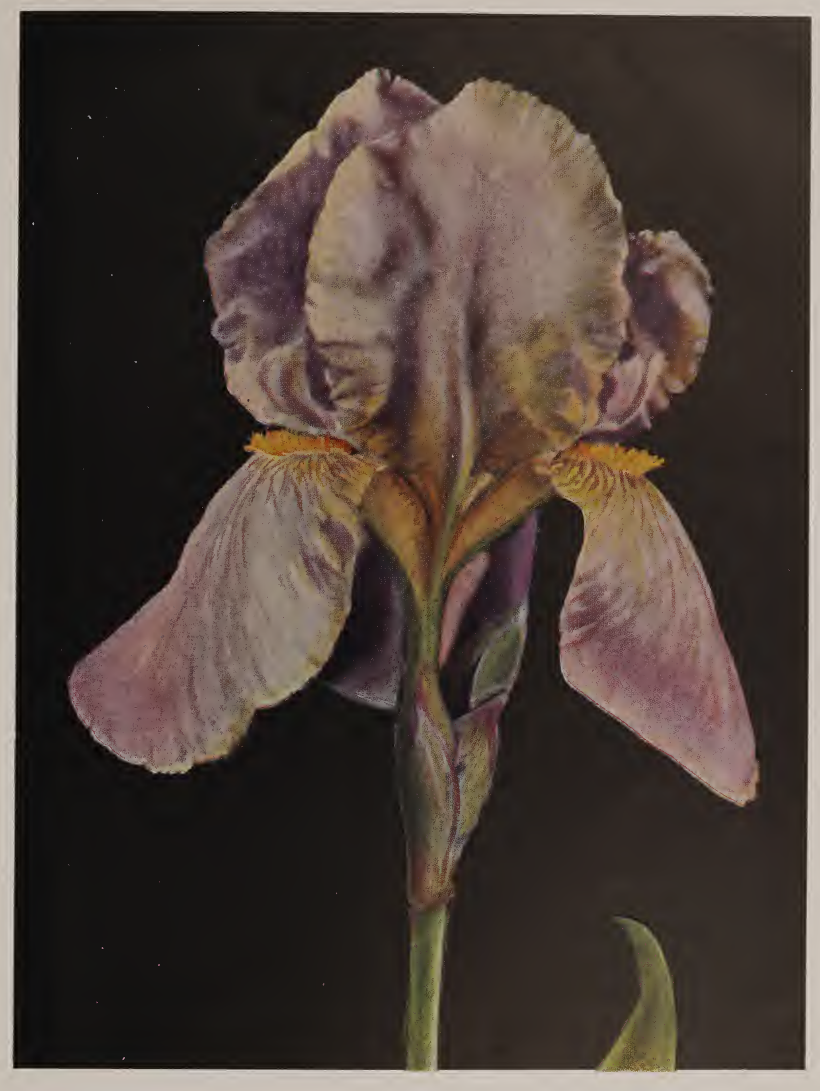
ZAHAROON (Dykes 1927)