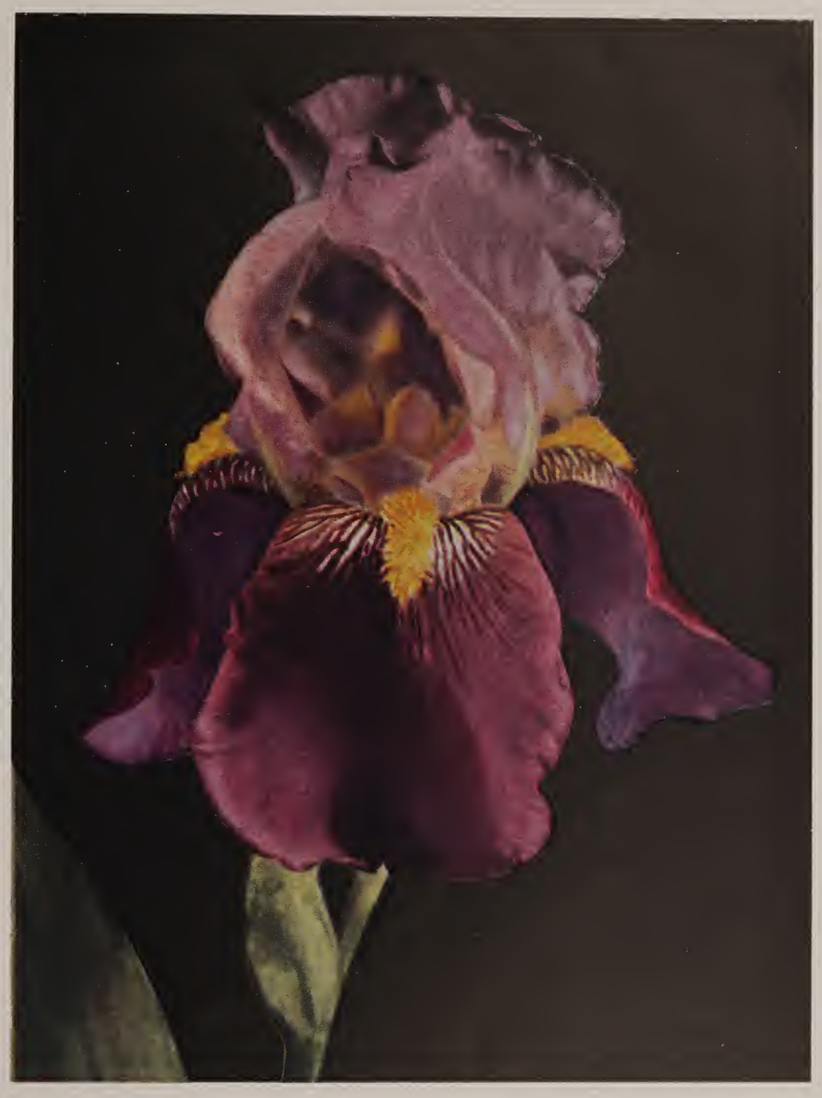
DEPUTE NOMBLOT (Cayeux 1929)