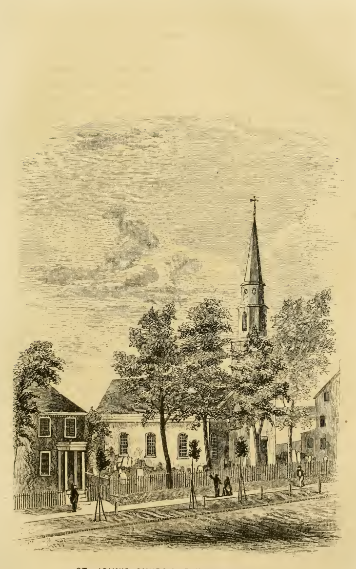
ST. JOHN'S CHURCH, ELIZABETH, IN 1850.