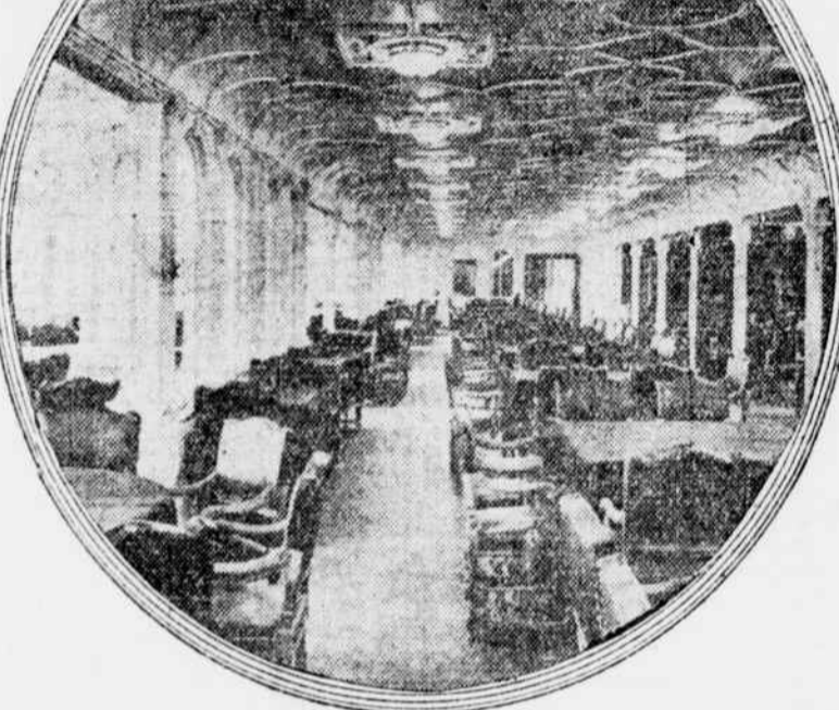
The first class saloon on the Titanic, decorated and furnished in a most sumptuous style.

Lots of time and bother to get it just right, but it pays. Lupton Bros., New York—Adv.