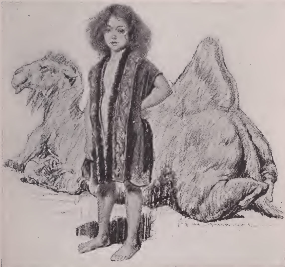
He was made tender of a small herd of camels.