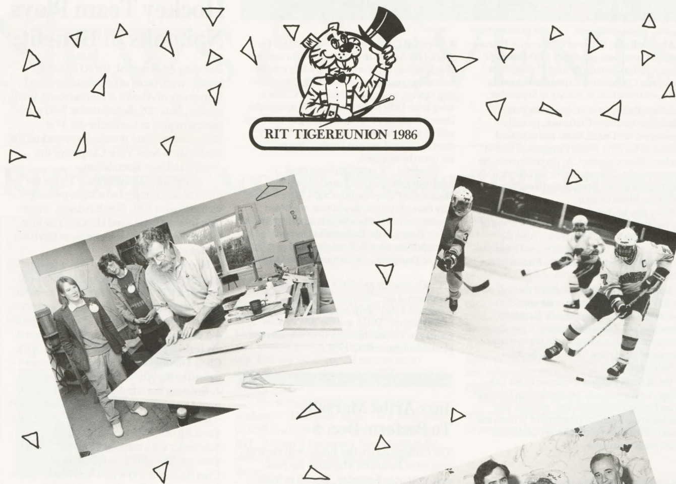
RIT TIGER UNION 1986