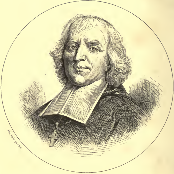
J BÉNIGNE BOSSUET,