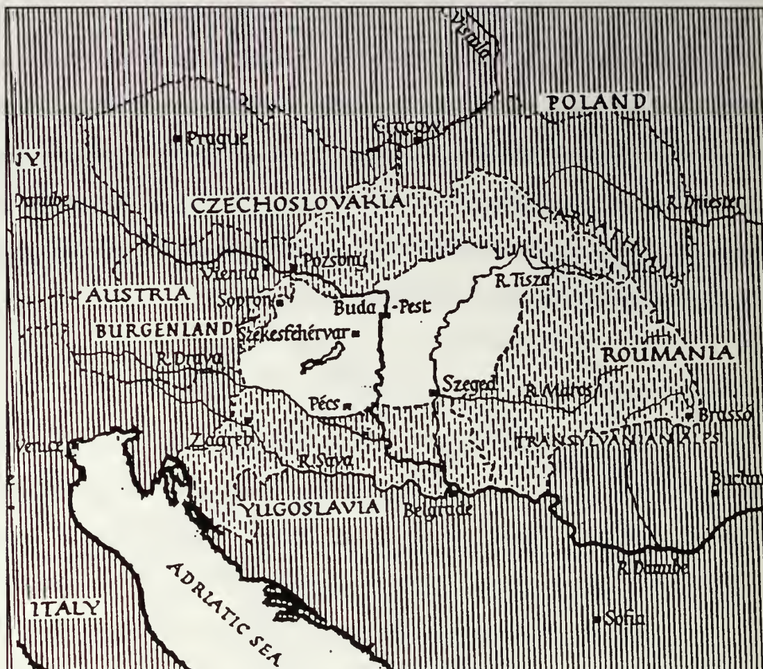
Figure 2 Map of Hungary after the Treaty of Trianon (Carlile A. Macartney, Hungary: A Short History , (Chicago: Aldine Publishing Company, 1962), 208.

a "balance" between the powers of Europe; neutrality in a sense. As it became obvious that the allies were either in no position to assist Hungary, or had no inclination to assist her, Hungary turned to other means.