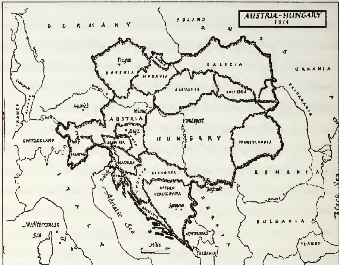
Figure 1 Map of the Austro-Hungarian Empire, 1914 (Edmond Taylor, The Fall of the Dynasties: The Collapse of the Old Order, 1905-1922 , (New York: Doubleday & Company, Inc., 1963), 71.