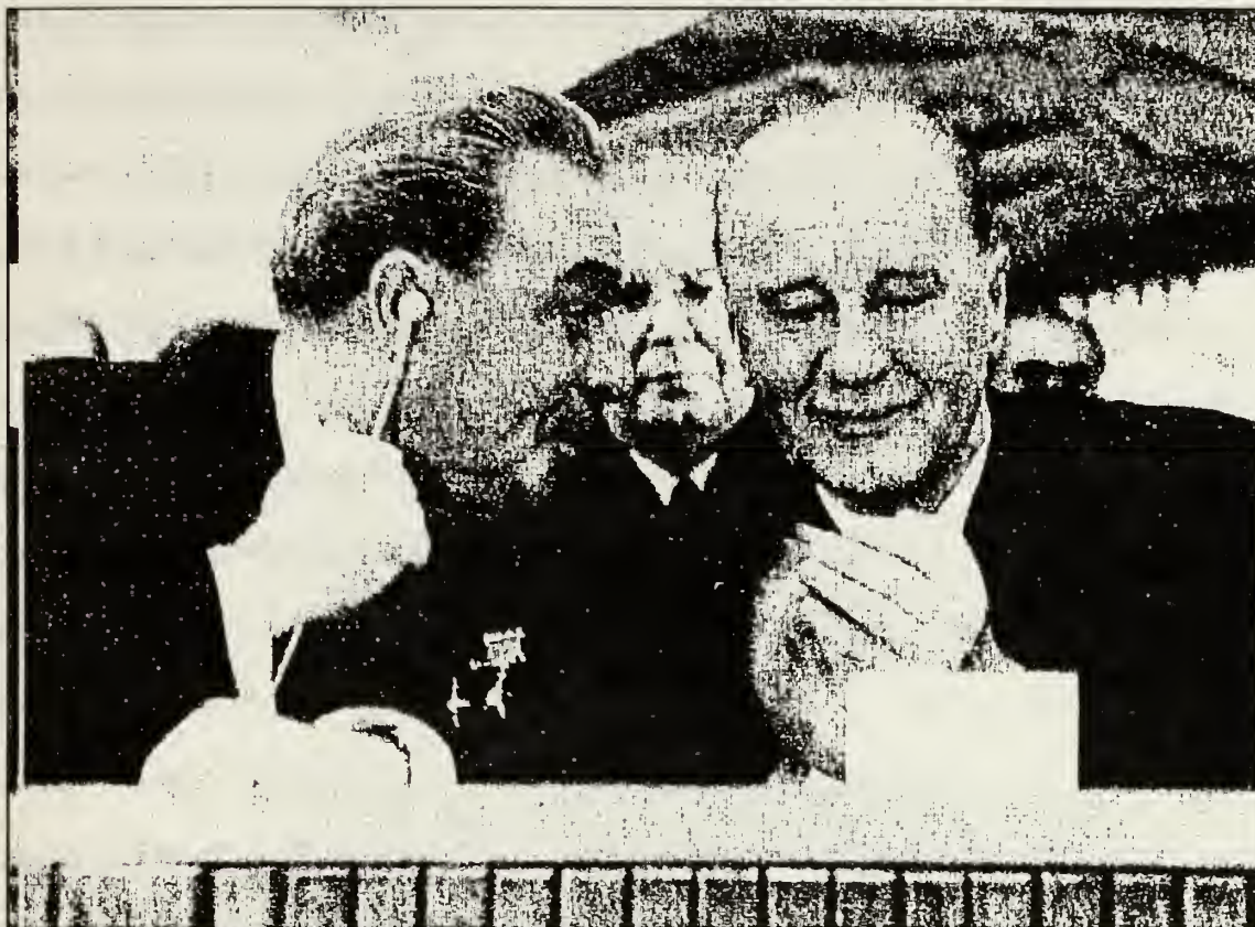
Figure 5 Leonid Brezhnev with János Kádár

indulgence in domestic economic reform. One of the primary requirements of NEM was the expansion of relations with the West. By 1972 pressure from the Soviets because of these contacts began to force Kádár to intervene in the NEM reforms. Although generally seen as a stable economy through the late 1970's, this heralded the beginning of the economic stagnation that characterized the Hungarian economy in the 1980's.