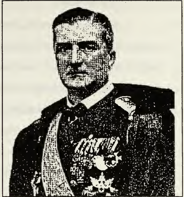
Figure 3 Admiral Miklós Horthy, Regent of Hungary

In 1938 and 1939, as Nazi Germany took Austria and Czechoslovakia, Hungary regained some lost territory. While the allies viewed Hungary as a part of the unrest in East-central Europe, Hungary hoped to be able to form some kind of alliance that would resist German domination of the area. Hungary saw Ruthenia as particularly important in this regard because it gave Hungary a common border with Poland