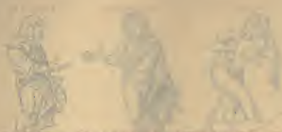
FIG. 1. CHAIR, TABLE, AND STOOL.

Exhibited from the collection of the Chinese Museum, New York, 1907