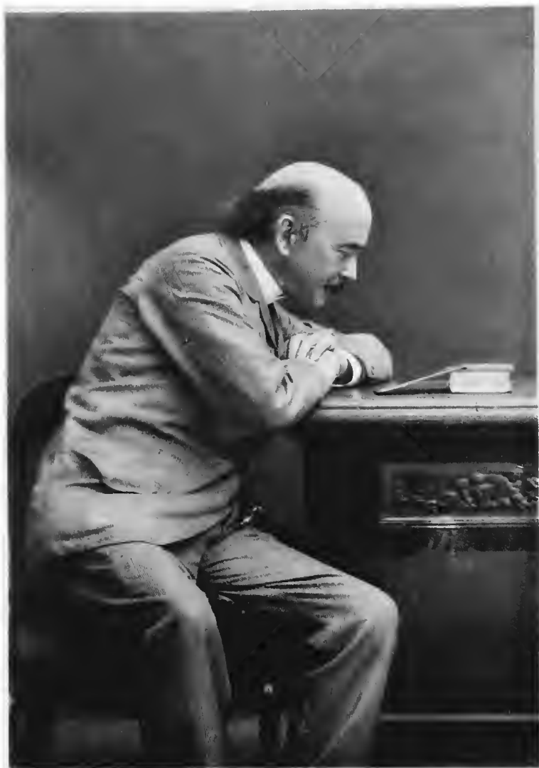
Dion Boucicault in His Study