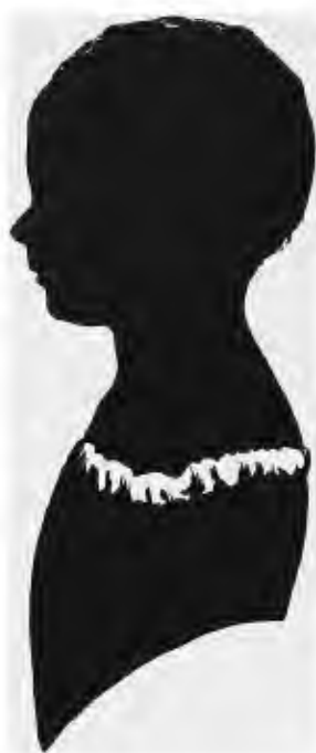
Silhouette of Dion Bouicault at the age of five