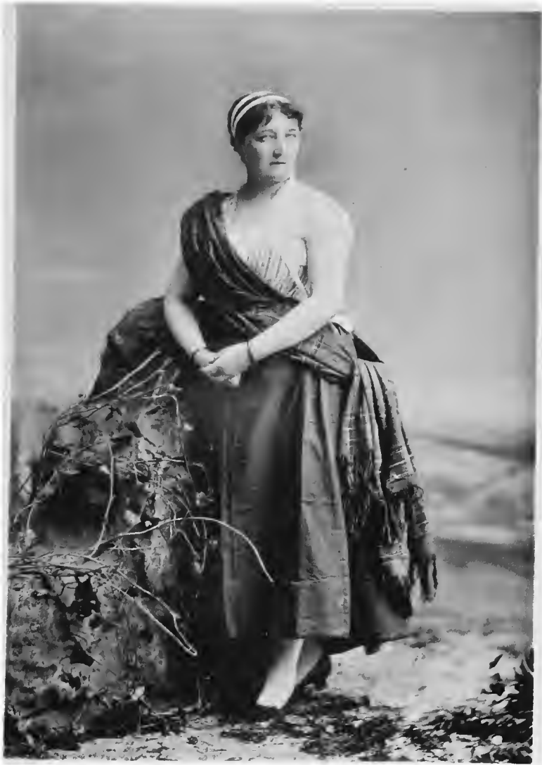
Agnes Robertson (Mrs. Dion Boucicault) in the title character in "Jessie Brown; or, The Relief of Lucknow"