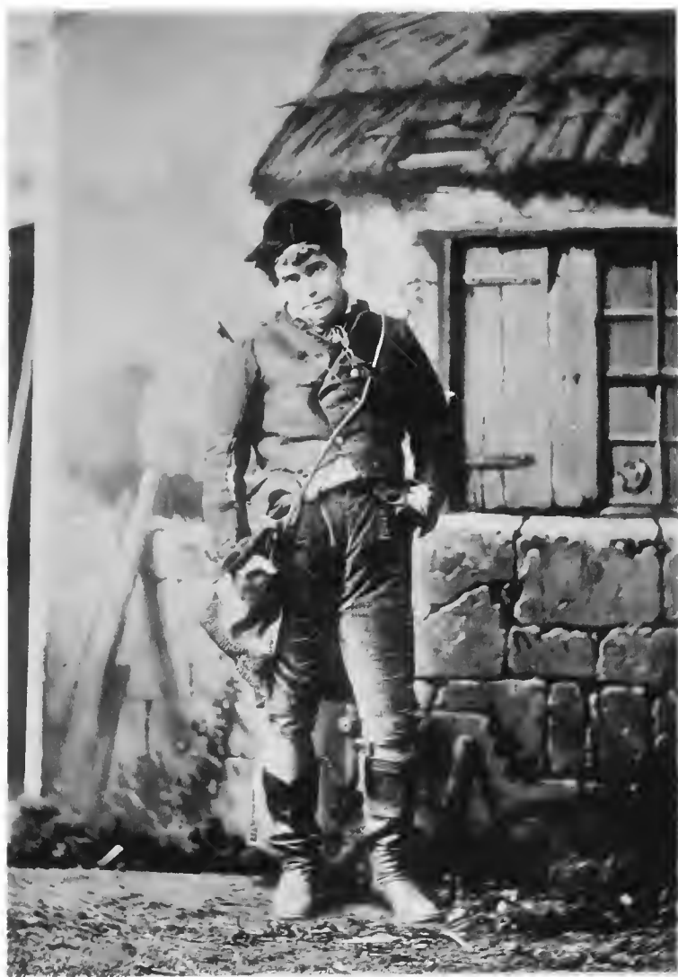
Dion Boucicault as Conn in "The Shaughraun"