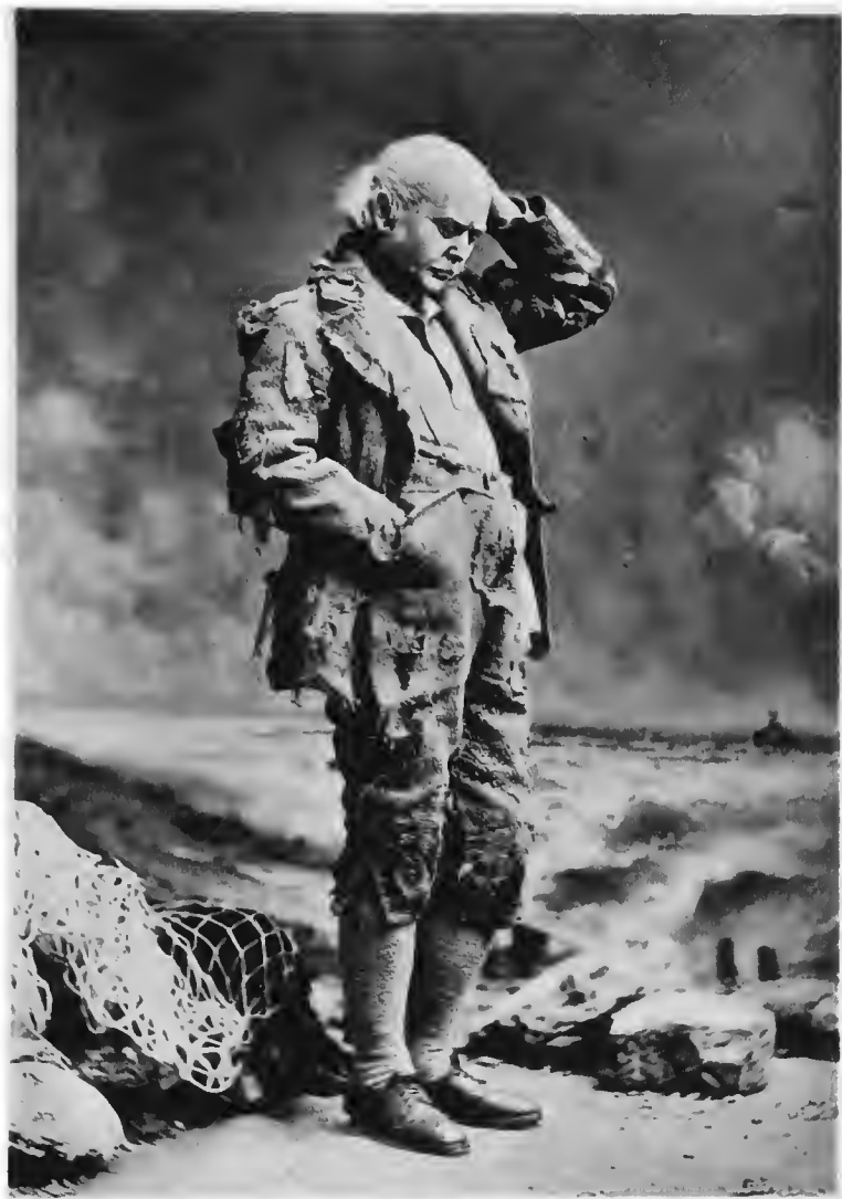
Dion Boucicault as Michael O'Dowd in "Daddy O'Dowd"