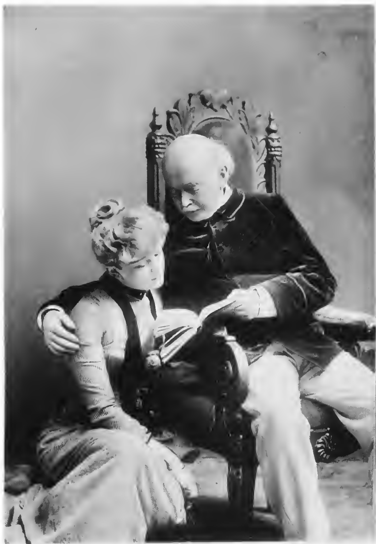
Dion Boucicault and Louise Thorndyke Boucicault