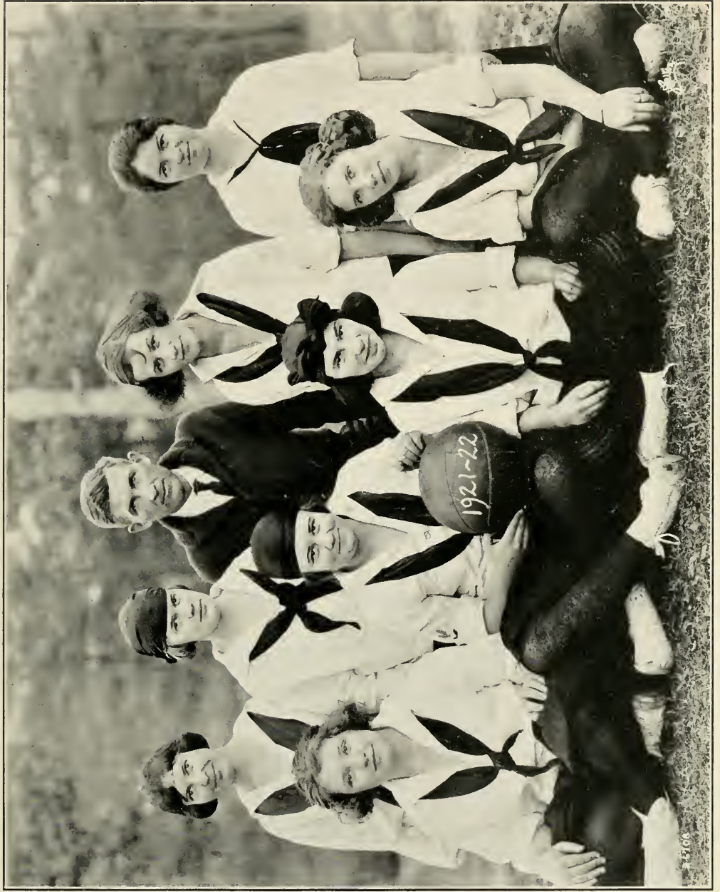
BASKET BALL TEAM