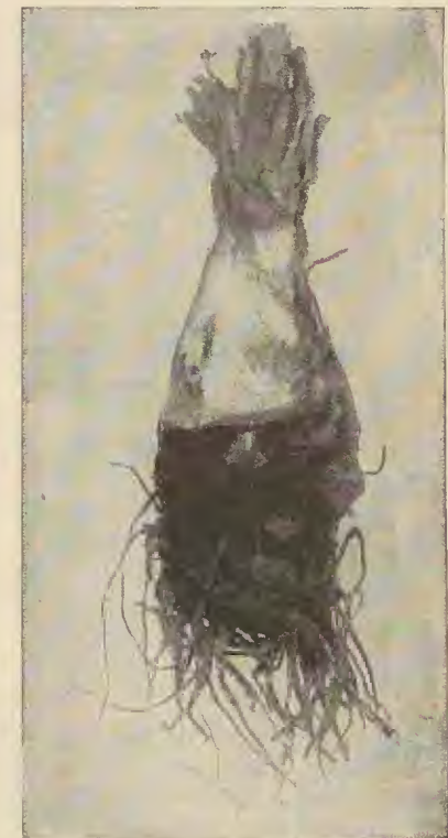
EXTRA QUALITY TUBEROSE PEARL.

For large quantities write us for special quotations, stating quantity wanted.