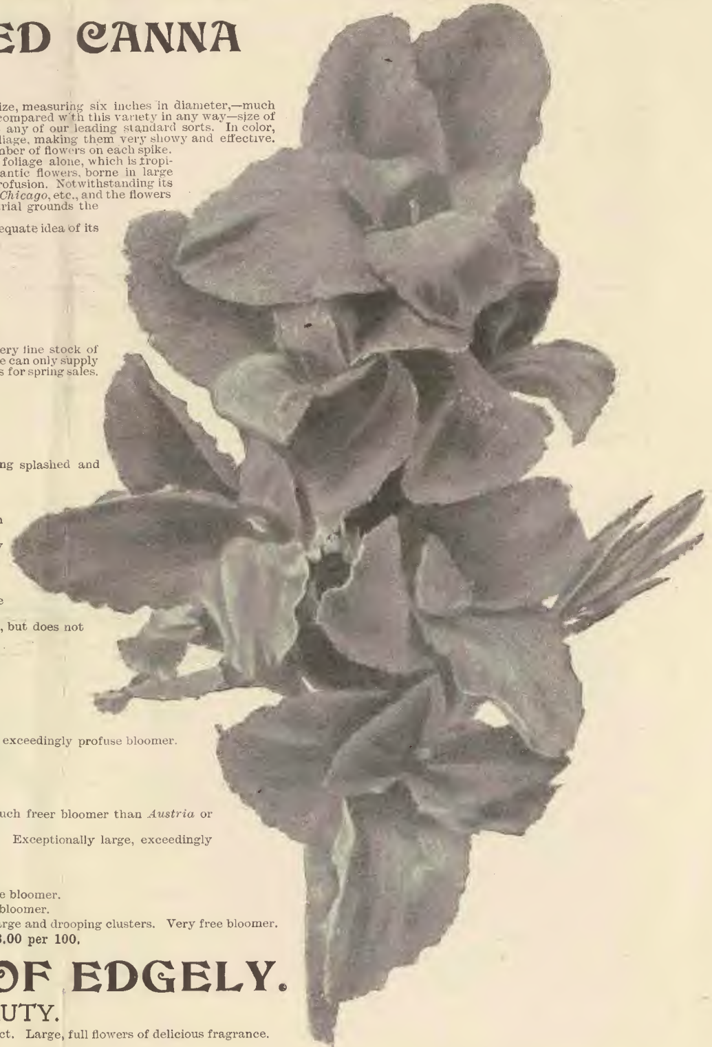
CANNA MRS. KATE GRAY.

Strong plants, 2½-in. pots, $9.00 per doz.; 50 plants for $25.00; 100 plants for $40.00.