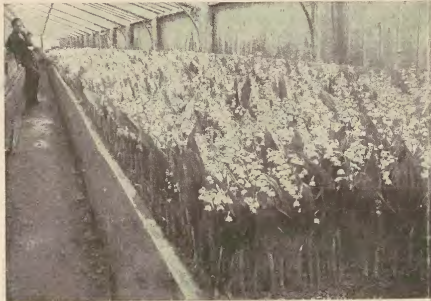
PHOTOGRAPH OF A HOUSE OF OUR PREMIER VALLEY.