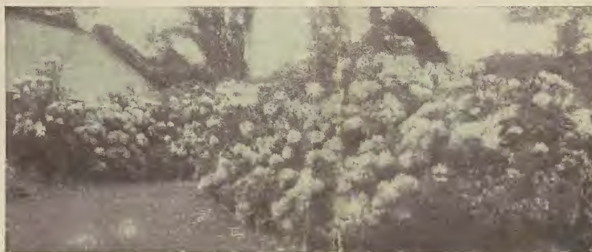
Photograph of a Group of Hardy Rhododendrons in Bloom. We make a specialty of these, and carry a large stock. For Prices, etc., see Page 6.

Prices subject to change without notice.