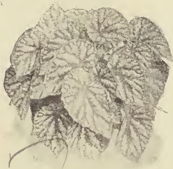
Copyrighted, F. R. PIÉRSÓN CO. REX BEGONIA PRES. CARNOT.

Extra strong plants in 3½-in. pots, $10.00 per 100.