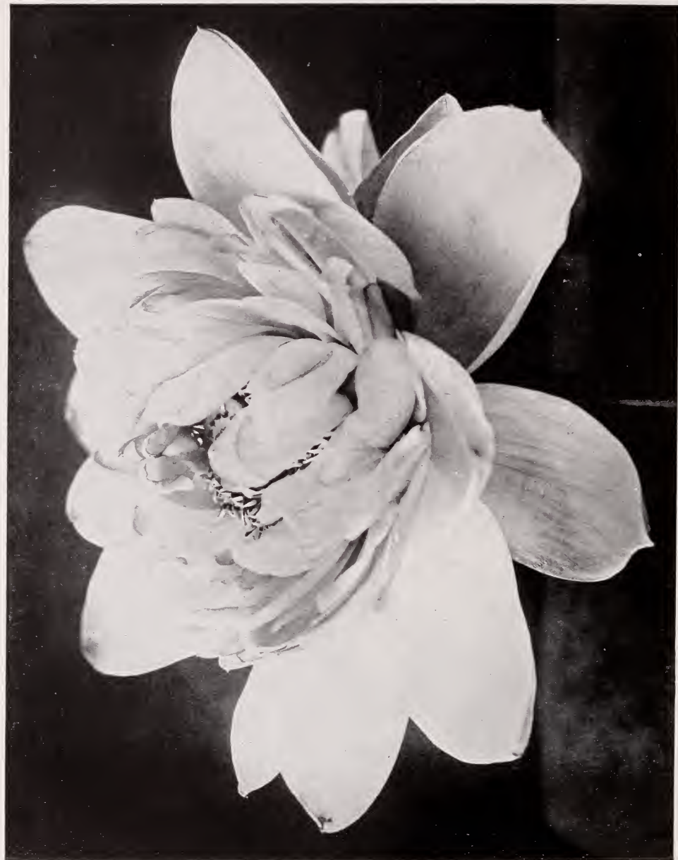
NELUMBUM ROSEUM PLENUM — ONE-FOURTH NATURAL SIZE