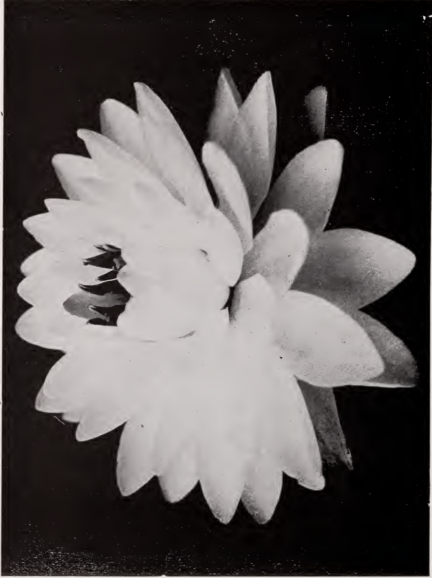
NYMPHAEA TUBEROSA RICHARDSONII. ONE-HALF NATURAL SIZE.