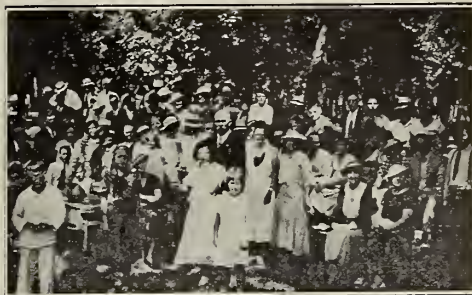
Some of the merry picnickers at the annual All-American Hen Club picnic, held in Riverside Park, Grand Forks, N. D. on July 7th, 1935.