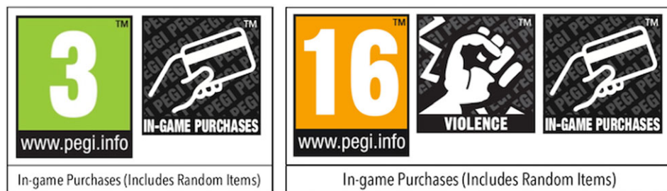
Figure 3. The current PEGI 'In-game Purchases (Includes Random Items)' content descriptor. © 2020 (Pan-European Game Information (PEGI)).

its label to instead read 'In-game Purchases (Includes Random Items)' (figure 3), which is identical to the ESRB's (except for the capitalization of the 'G'), soon after the initial announcement (without a further announcement) by retroactively partially changing the initial announcement (see §4.3.3 for further detail). As of 16 January 2023, the PEGI announcement's text still referred to the older label, but the image accompanying has been changed to reflect the current (i.e. the ESRB's) label. These two largely identical labels are intended to cover, according to the ESRB, 'all transactions with randomized elements' [3]. The ESRB and PEGI both consciously chose to specifically not use the term 'loot boxes' to 'avoid confusing consumers' [3], particularly parents who might not have sufficient knowledge about video games or 'ludoliteracy'.