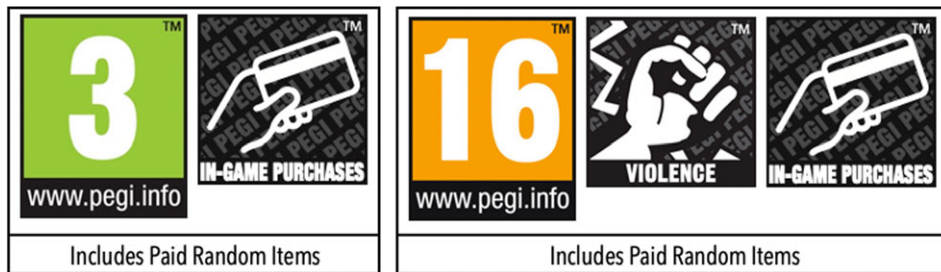
Figure 2. The originally announced, but since replaced, PEGI 'In-game Purchases (Includes Paid Random Items)' content descriptor. © 2020 Pan-European Game Information (PEGI).