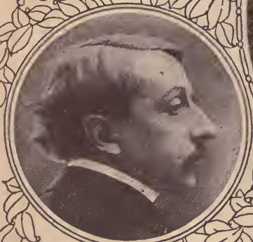
M. BARRÈS De l'Académie Française