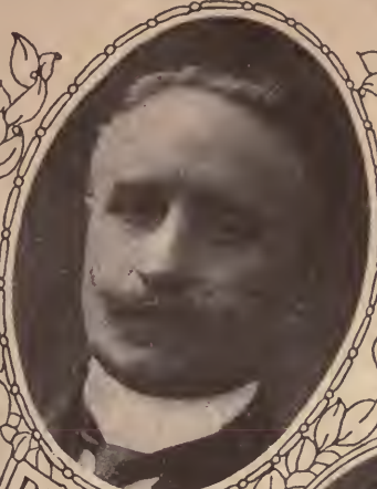
DESCHANEL de l'Académie Française Président de la Chambre