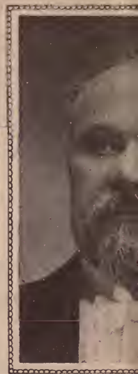
R. POINCARÉ Président de la République