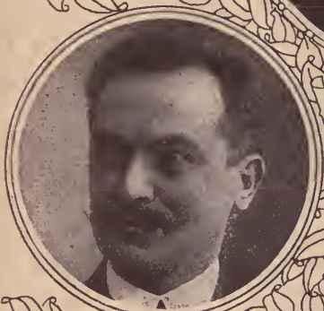
LEBRUN Ministre du Blocus