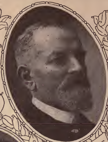
A. DUBOST Président du Sénat