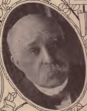
CLÉMENTEAU Président du Conseil