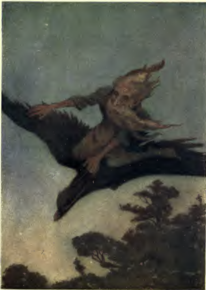
OVERHEAD SHE SAW A LITTLE DWARF MOUNTED ON A RAVEN