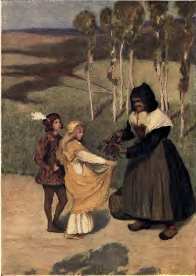
SHE RAISED HER LITTLE SKIRT WITH HER TWO HANDS