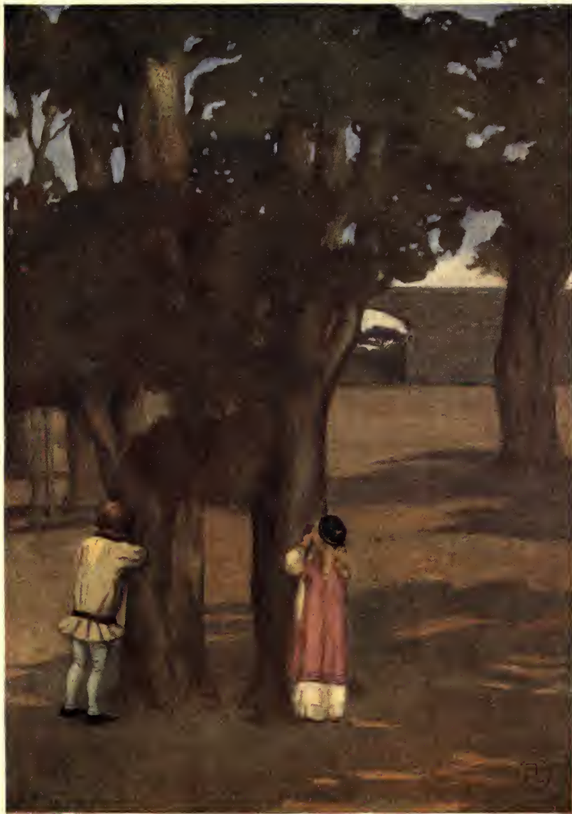
HONEY-EEE AND GEORGE WERE STILL WEEPING, EACH IN FRONT OF A TREE