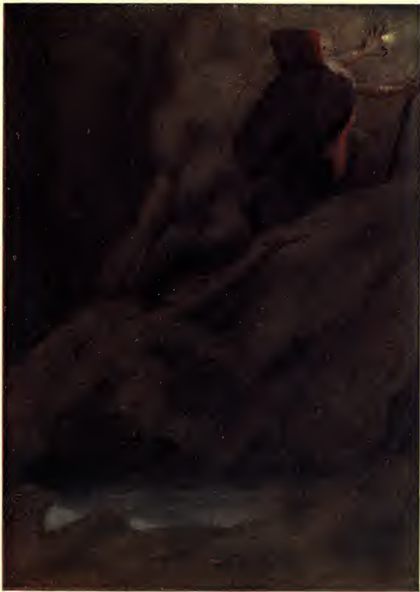
HE PENETRATED INTO GLOOMY CAVERNS