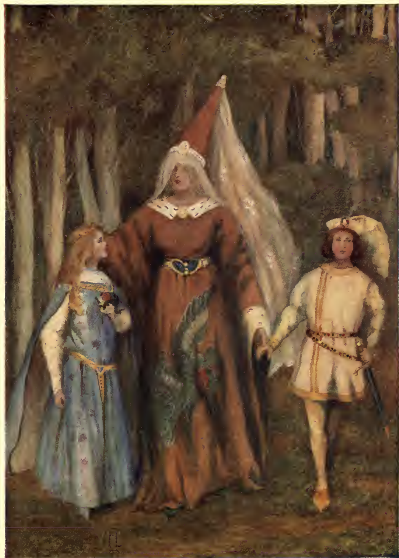
"LET US . . . WALK TO THE CHAPEL."