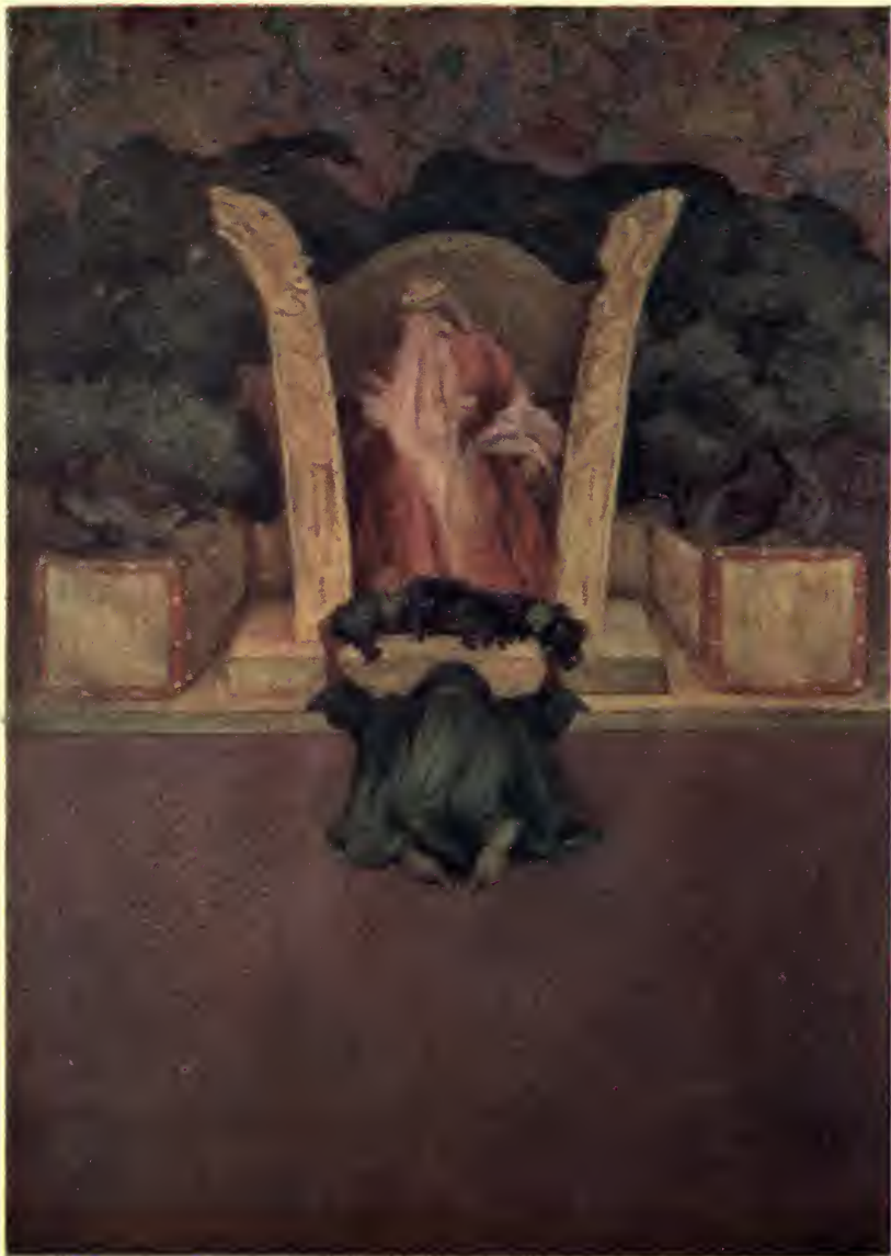
PAU, A SIMPLE JUST SOUL, OFFERED HER A BASKET OF GRAPES