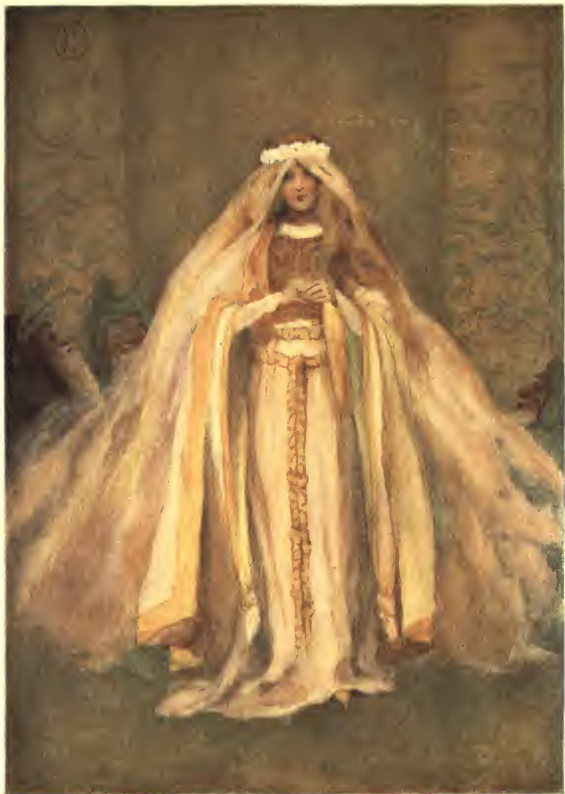
HONEY-BEE, PRINCESS OF THE DWARFS