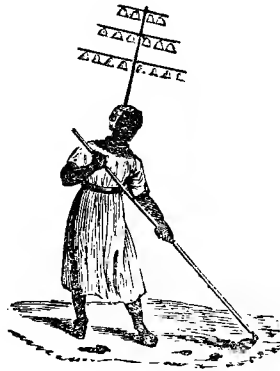
A WOMAN WITH IRON HORNS AND BELLS ON, TO KEEP HER FROM RUNNING AWAY.