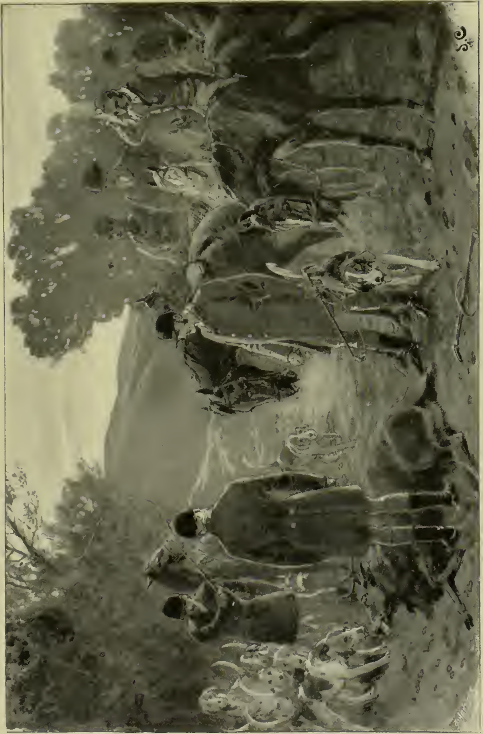
KILLED AFTER RUNNING THROUGH TWELVE DIFFERENT PARISHES