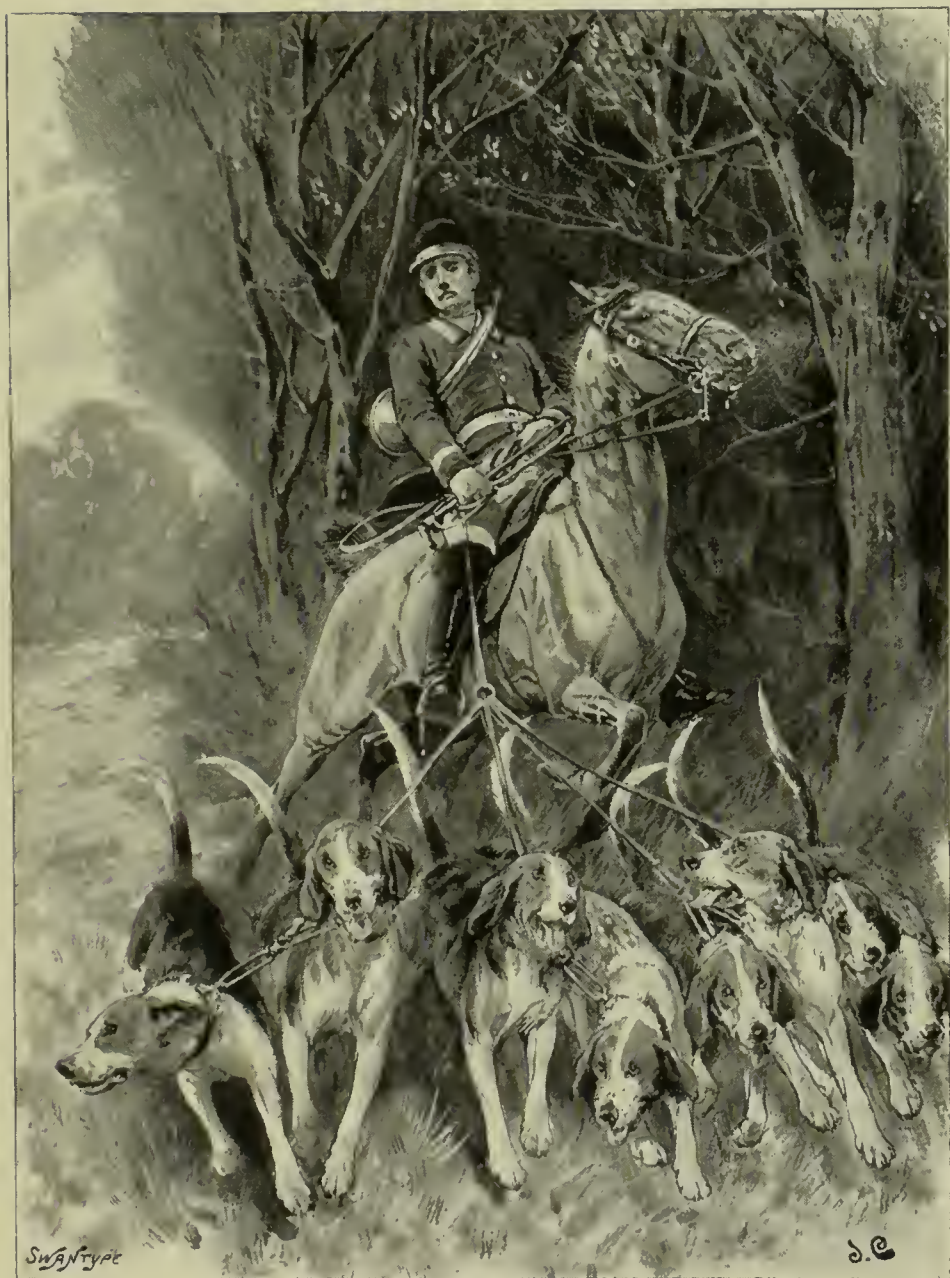
RATHER A HANDFUL