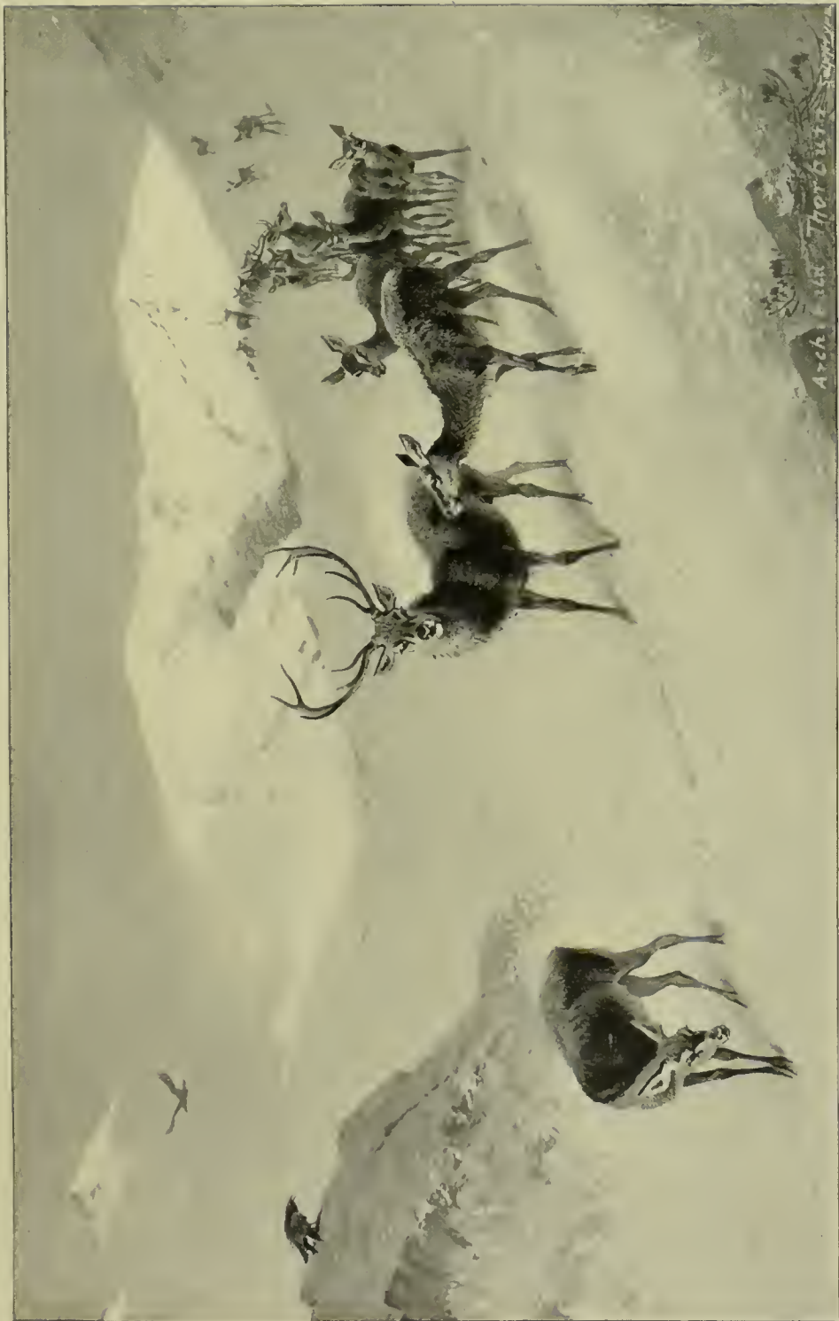
DRIVEN OFF THE HILL