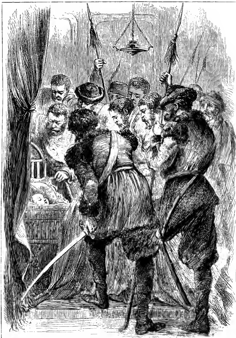
THE SLEEP OF INNOCENCE.