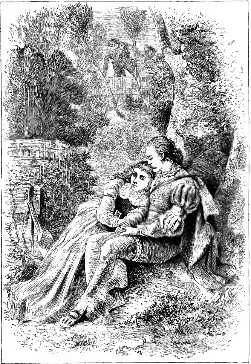
NATALIE AND COUNT PAULO.