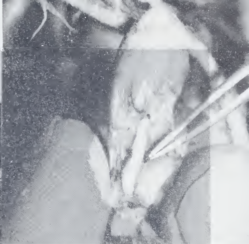
Larva of the southern corn rootworm in nearly mature peanut pod.