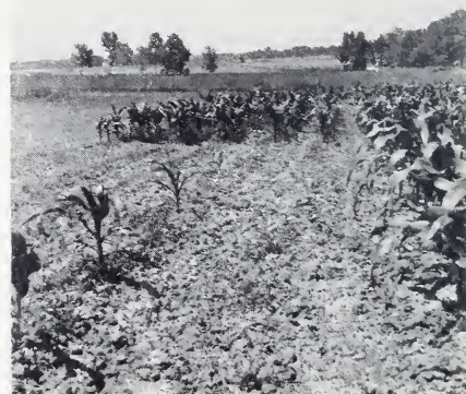
Untreated check area center to lower left; aldrin treated plot to right; and heptachlor treated area beyond center of photo.

Treat a band about 6 inches wide over the row or hills, just behind the planter shoe. Be sure that the soil closing in behind the planter shoe covers the insecticide. Do not place the insecticide directly on the seed.