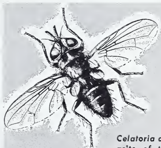
Celatoria diabroticae , a parasite of the southern corn rootworm.

3. Broadcast an aldrin-fertilizer mixture with a fertilizer distributor, or apply it to the rows with fertilizer side-dressing attachments. Directions on the bag will show the amount you need to use to obtain the recommended per-acre dosage of insecticide.