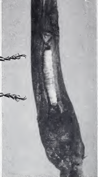
Adult and larva of the southern corn rootworm.