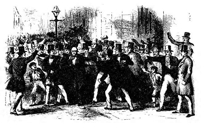
LAW AND ORDER. Page 230.