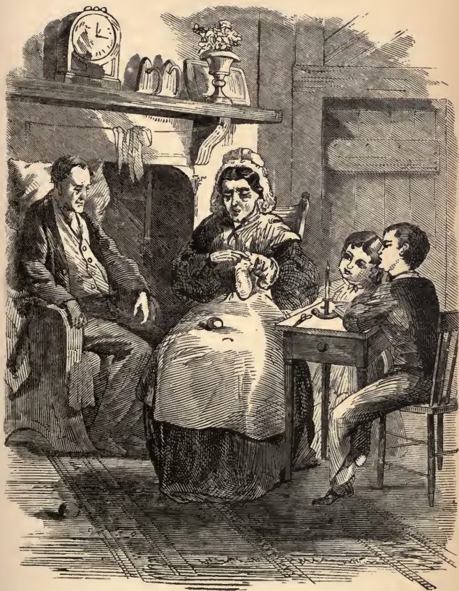
"By-and-by Tip brought out his grammar." — Page 209.