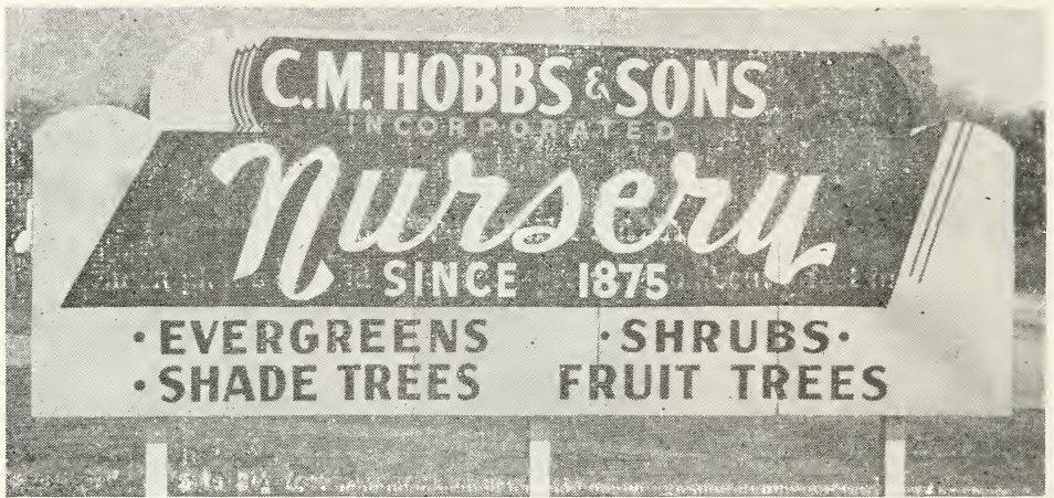
Look for This Sign 6 Miles West of Indianapolis on U. S. 40