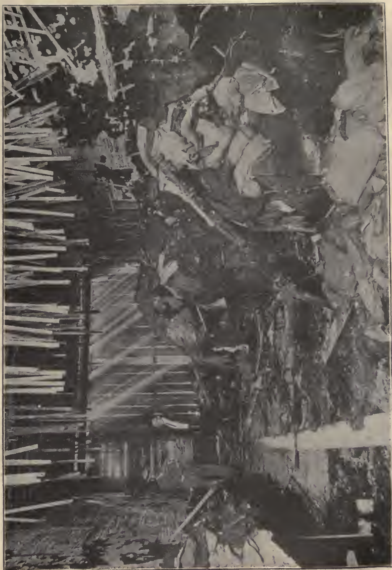
A good job by one of the fire bugs. Incendiary fires are supposed to have totaled one-half Chicago's annual loss. The trust heads are now in Joliet and insurance rates are down again.