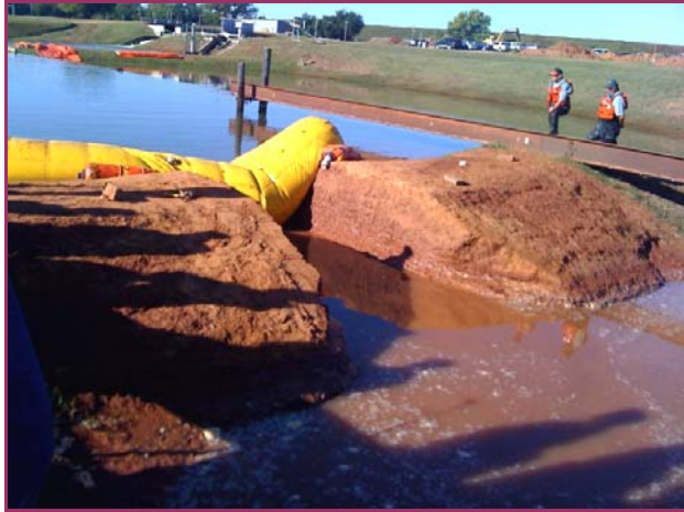
Figure 2. Large Scale Model used at HERU in the RRLB study.

Following the small and intermediate scale experiments, each of the three concepts were evaluated at large scale using the facilities available at the Hydraulic Engineering Research Unit (HERU) of the Agricultural Research Service in Stillwater, OK. Each of the three concepts involves the use of reinforced fabric tubes filled on-site with locally available water. All concepts tested at HERU yielded promising results, matching the results obtained at small and intermediate scales.