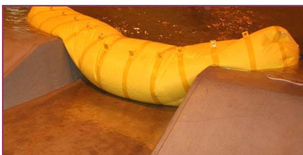
Figure 1. Intermediate Scale Model used in the RRLB Study.

To achieve the ability to respond rapidly, CHL developed concepts and strategies that focus on solutions that are helicopter transportable and deployable. A fast-paced study of many different concepts for the rapid repair of breached levees led to the development of promising new methods to accomplish such repairs, potentially even when massive amounts of water are flowing through the breach. This method is currently being developed/refined and features a large water-filled fabric-reinforced tube that is filled on-site after delivery by helicopter.