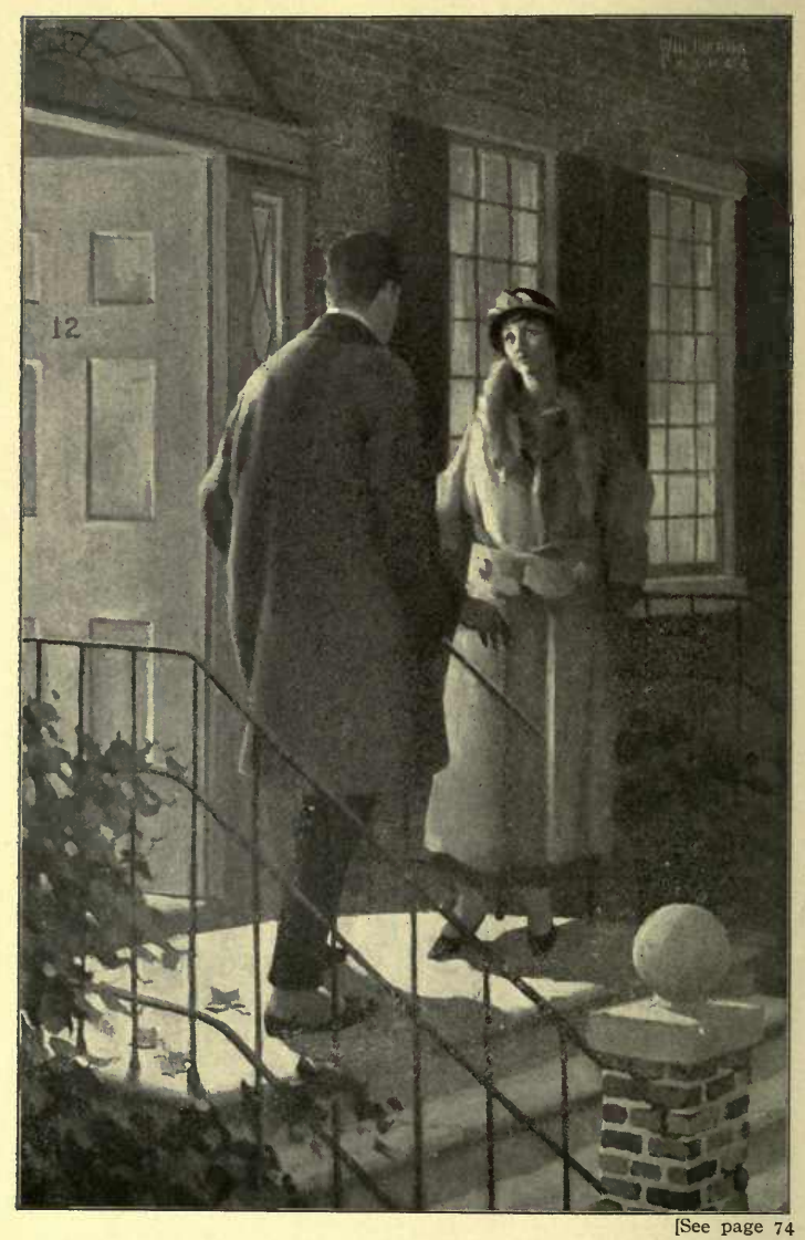
"NO PURITY OF PURPOSE CAN OVERCOME THE TYRANNY OF CONVENTION"