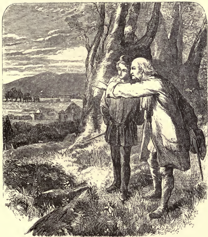
— a white-haired man, Pithy of speech, and merry when he would. THE OLD MAN'S COUNSEL, p. 218.