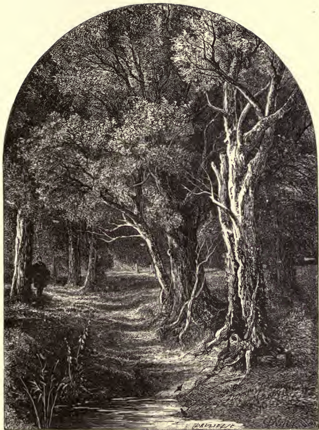
The groves were God's first temples. A FOREST HYMN, p. 88.