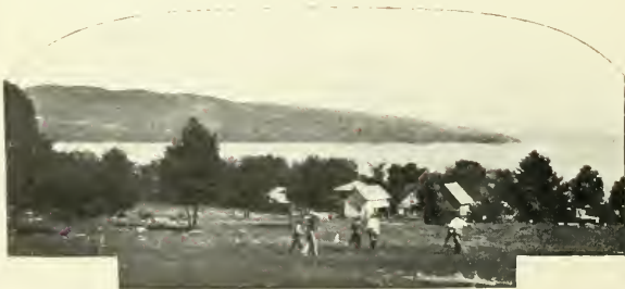
EAST VIEW FROM NINTH TEE

T HE wide piazzas of the Inn command a fine view over the sloping lawns and flower garden, two tennis courts, shaded by large elms, the boat house on the shore below, the picturesque steamboat landing, and beyond, the circling shores of the great bay, with the near foot-hills