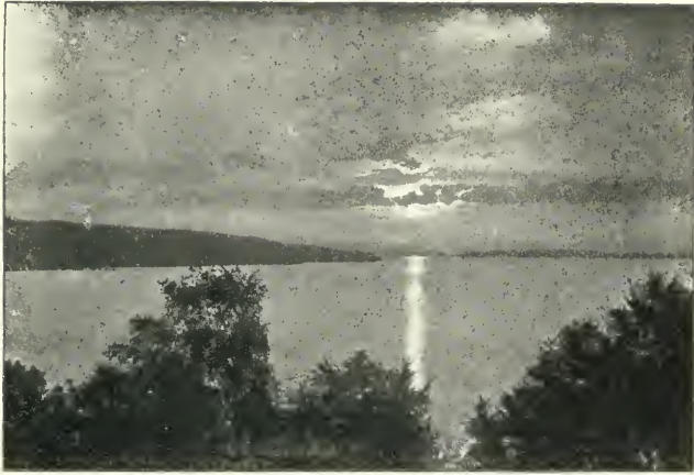
MOONLIGHT FROM THE INN PIAZZA

of the Adirondacks, the long slopes of the Split Rock range, and, in the background across the Lake, in Vermont, the great chain of the Green Mountains extending from the famous Camels Hump in the north to Snake Mountain in the south.