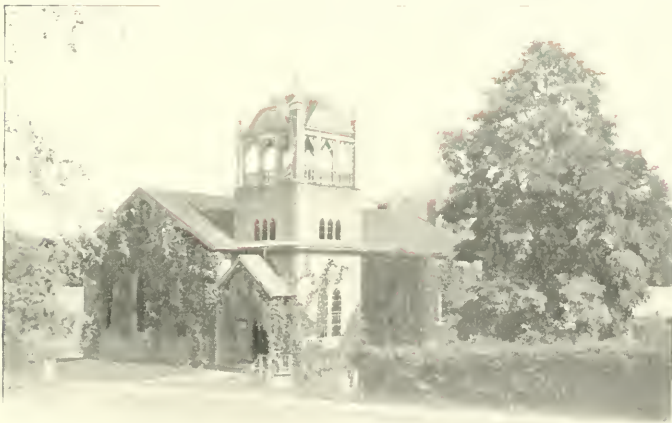
ONE OF THE CHURCHES