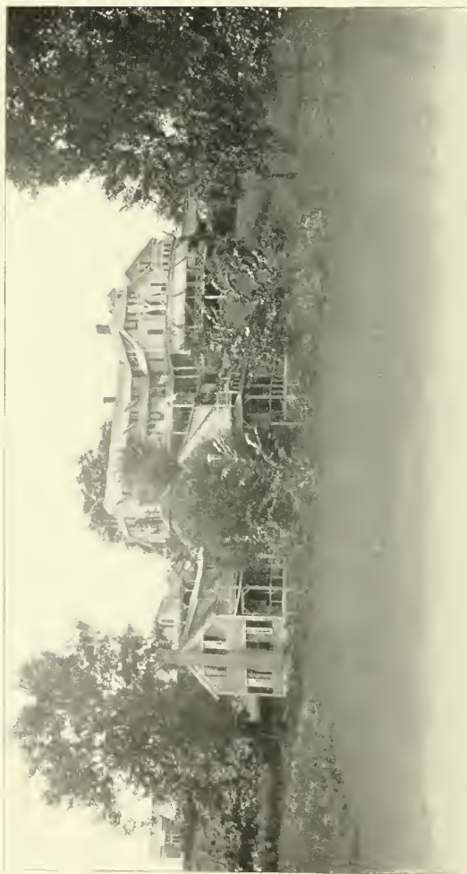
THE INN FROM THE LEANING COURT