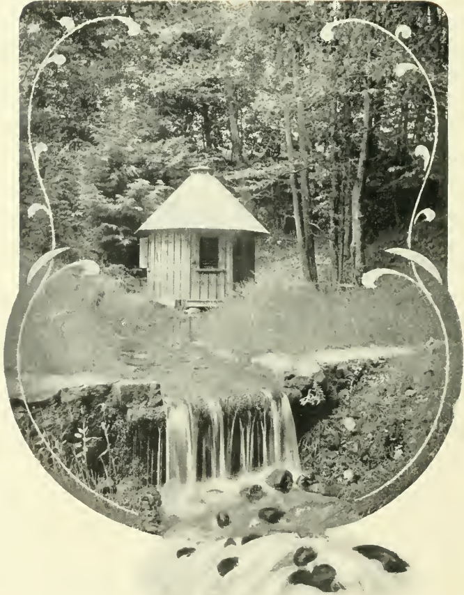
THE WESTPORT MOUNTAIN SPRING.

The picturesque surroundings supply a fine field for the amateur photographer, and the Inn is provided with a dark room fitted with appliances for developing plates.