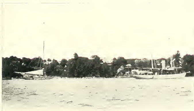
AT ANCHOR OFF THE INN BOAT HOUSE

This place has been known for many years as the eastern gateway to the Adirondacks.