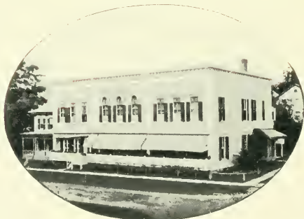
OVER THE WAY

lovely Otter Creek, past the old Fort Cassin to the pretty city of Vergennes, which has the honor of being the oldest in Vermont.