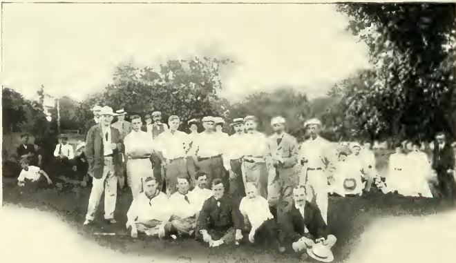
AFTER THE TOURNAMENT

The rolling character of the ground furnishes the best of hazards and with water piped to every green excellent conditions of the course is assured.