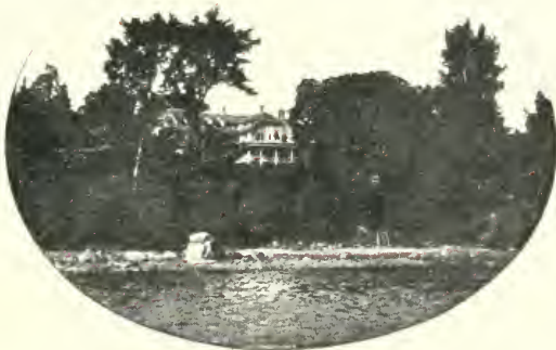
THE BATHING BEACH

THE bathing is unexcelled in the clear, cool waters of the lake; there are bath houses for the guests of the Inn, and a float for the more expert swimmers, while the gentle slope of the beach and clean sand affords an excellent play ground for the children.