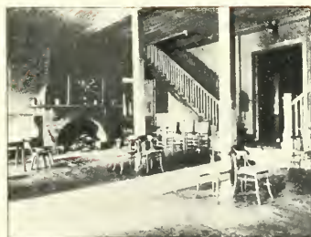
CORNER OF OFFICE

There are also two small steamers that can always be chartered to explore the enchanting coves and islands, which have, many of them, historical associations, and also to make one of the most unique trips in the country up the