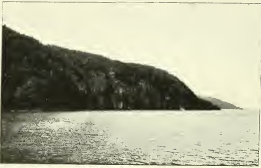
THE HIGH ROCKS ON SPLIT ROCK MOUNTAIN

traces of odor, agreeable to the taste, and is of exceptional chemical purity. It contains but a small quantity of mineral matter, and is therefore a "soft" water. It is a delicious table water, long noted as an absorbent of all chalky formations, and an alleviation of all gouty tendencies. As a bathing and toilet water it is of marvelous quality. The spring requires no reservoir, and the water is carried directly from the fountain head to the village, three miles away.