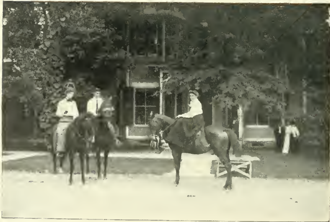
OFF FOR A DRIVE

T HE lake excursions are numerous; the fine, great steamers of the Transportation Line touching here four times daily, giving opportunity for delightful trips to the old fort at Ticonderoga, the old French and English forts at Crown