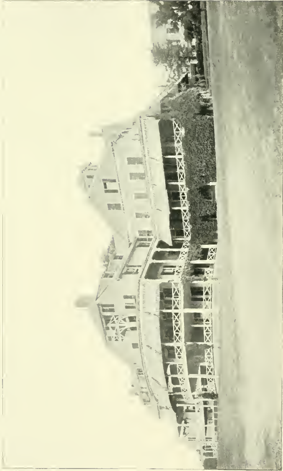
THE INN FROM THE LAKE