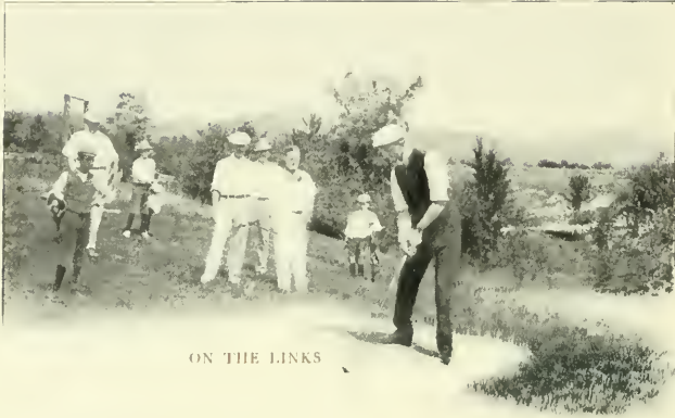
ON THE LINKS